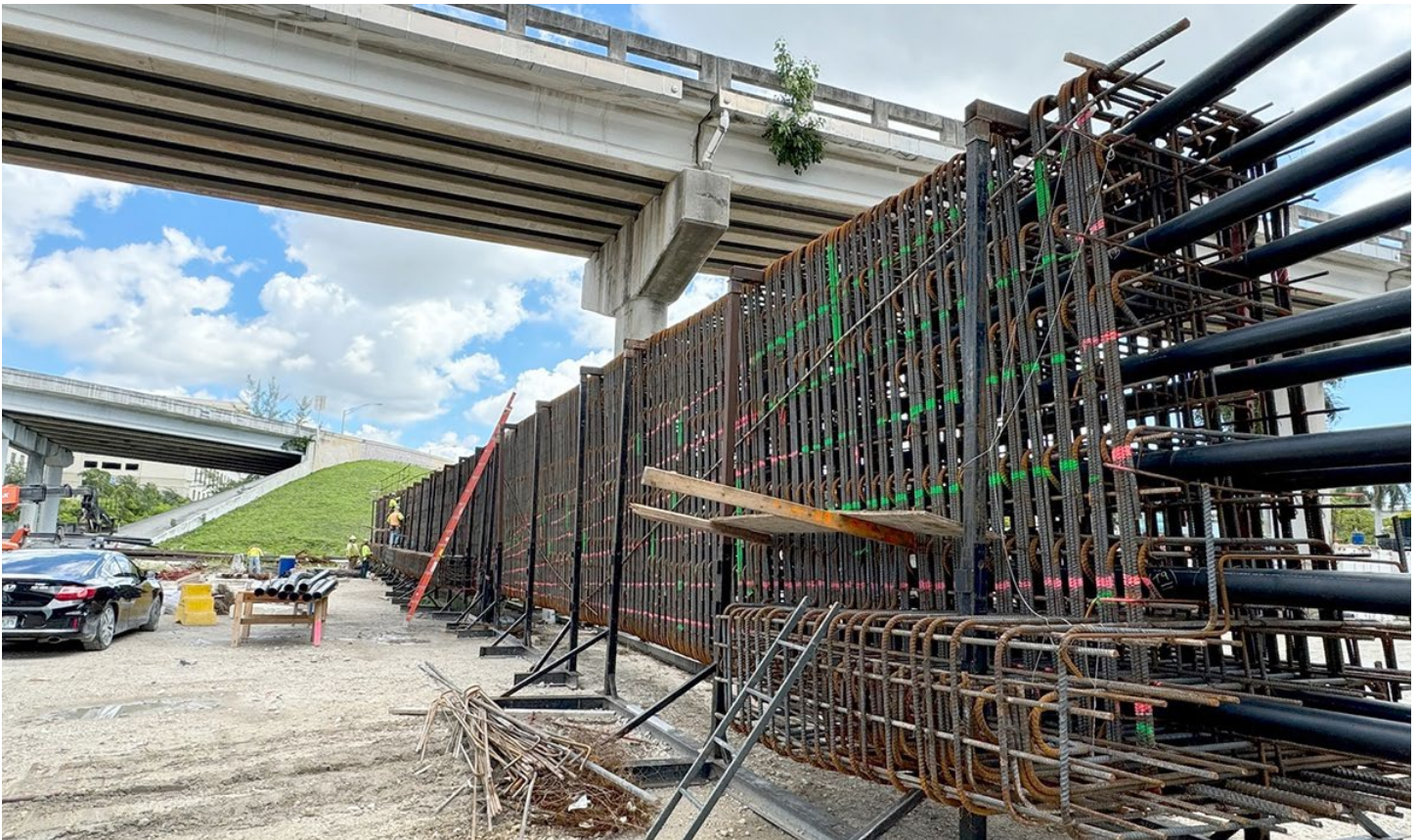
Crews tying reinforcing steel for the Bridge structure over eastbound State Road 836 just west of I-95

Complete closures of eastbound State Road (SR) 836 continue to be implemented from NW 17 Avenue to I-95, as noted below, to safely construct a bridge support structure that will span the entire width of eastbound SR 836 just west of I-95.