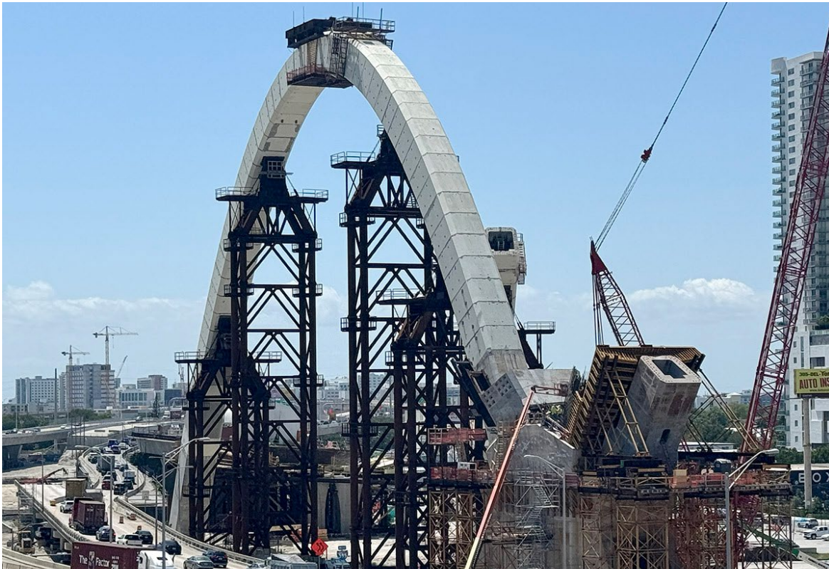
Ongoing work at the I-395 signature bridge site