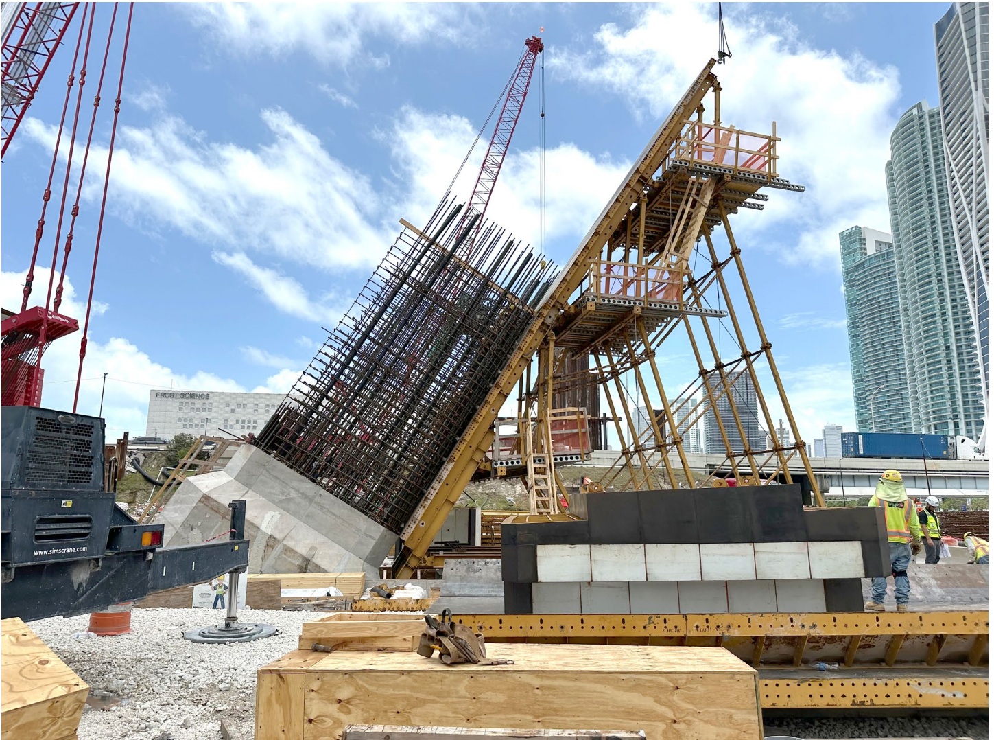
Ongoing installation of reinforcing steel at one of the I-395 signature bridge arches