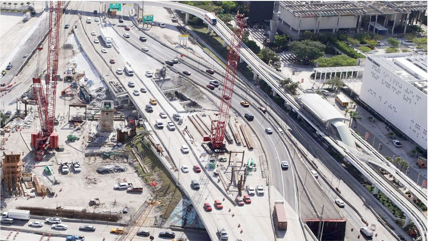
Ongoing arch foundation work adjacent to the Biscayne Boulevard ramp to the MacArthur Causeway