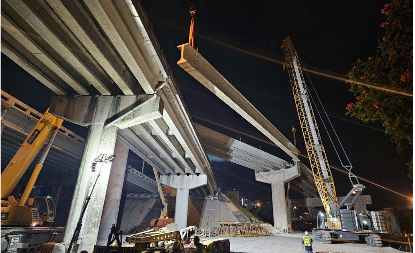
Installation of bridge beams for future ramp to southbound I-95