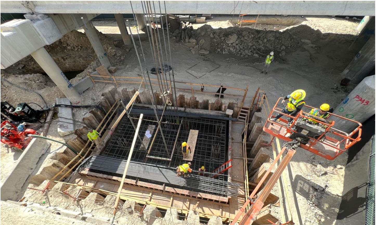
Crews tying reinforcing steel for a new SR 836 foundation and pier adjacent to NW 10 Avenue