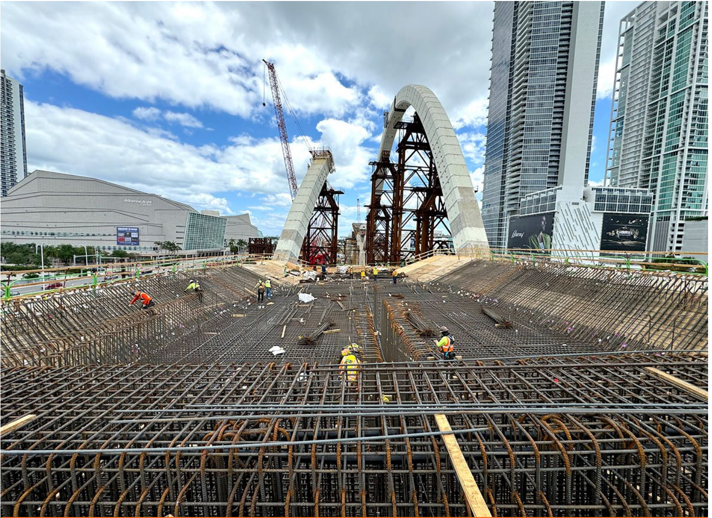
Placing reinforcing steel for I-395 cast in place bridge superstructure