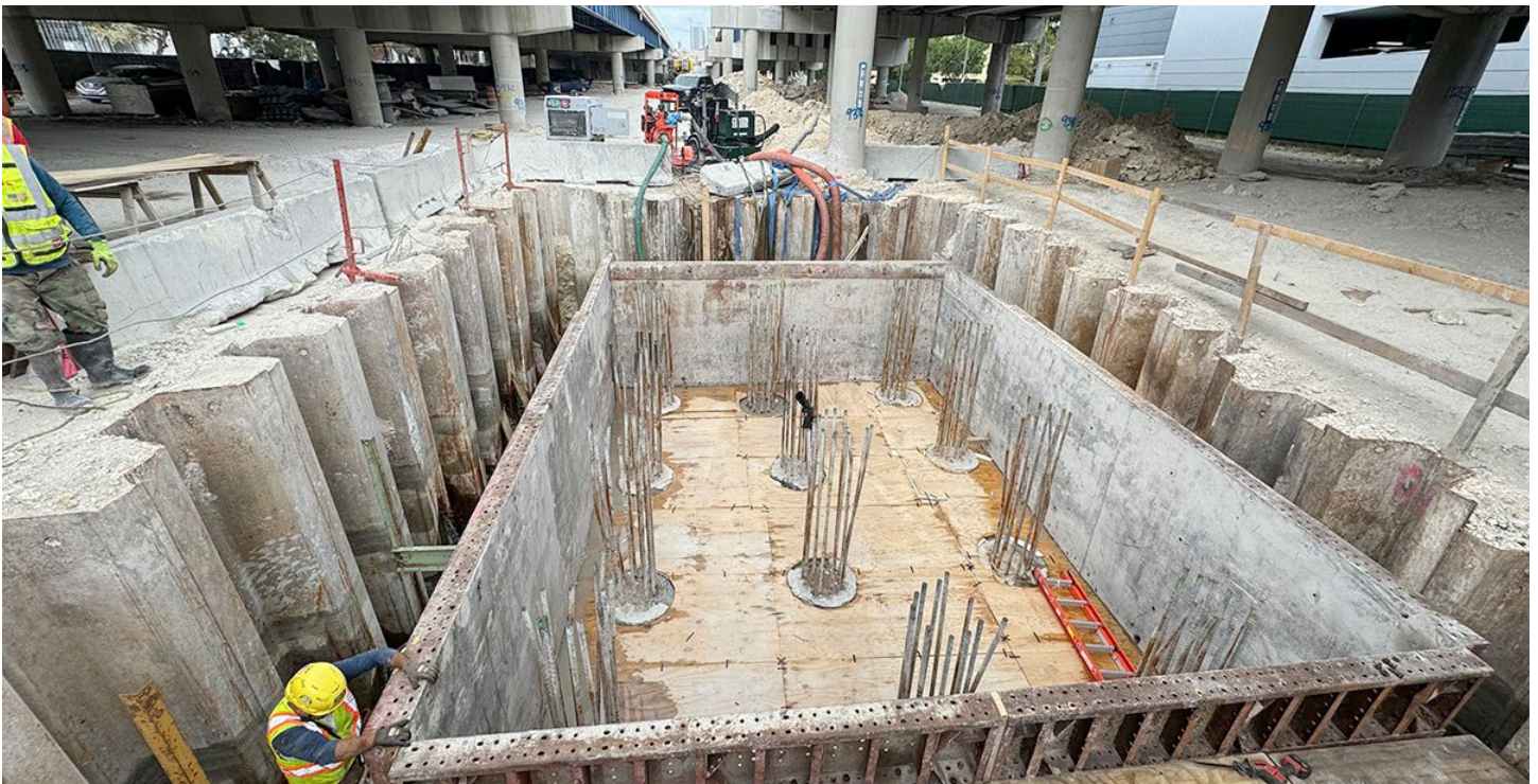
Bridge foundation work for SR 836 double-decked roadway just east of NW 10 Avenue