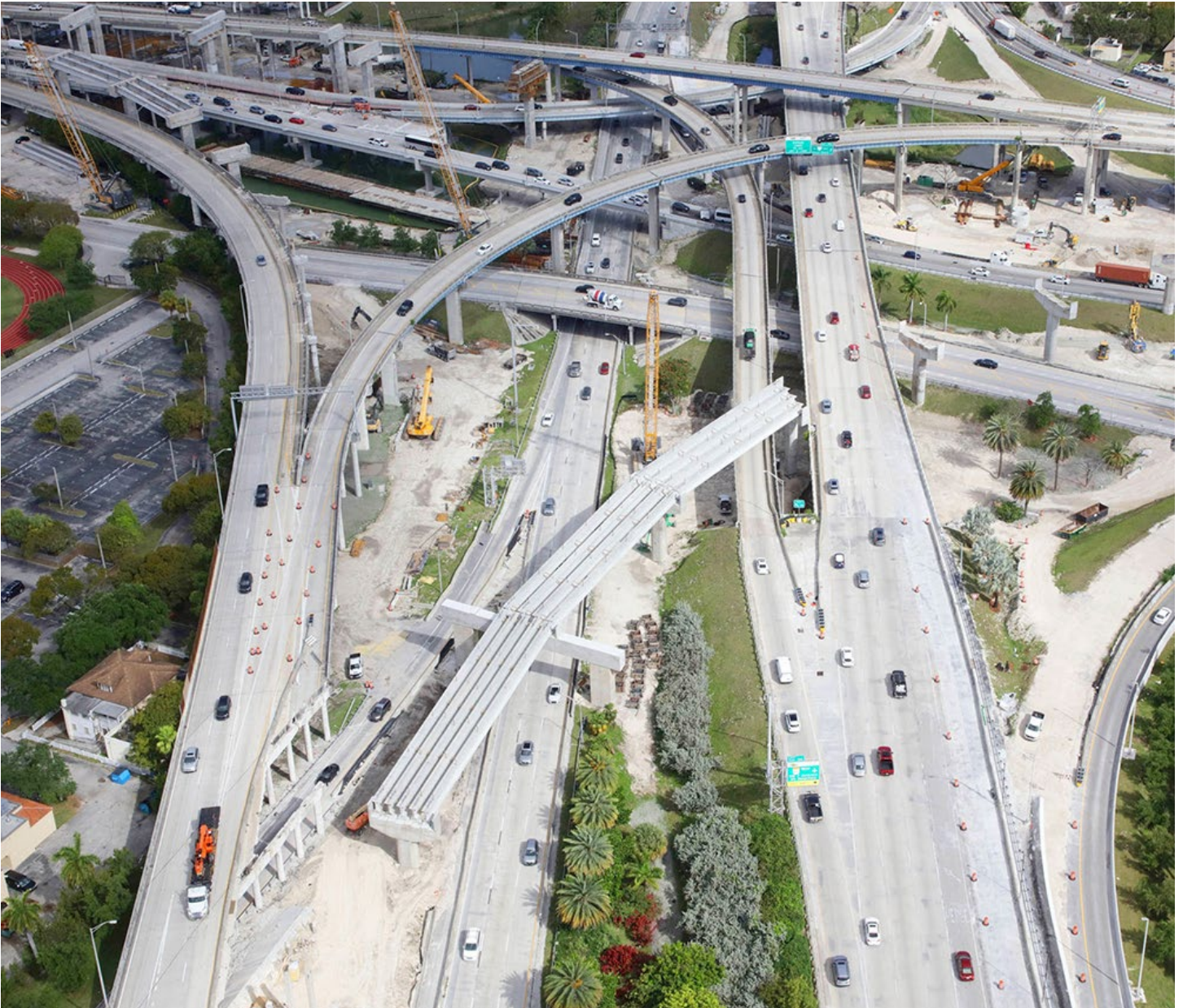
Bridge beams for the new westbound I-395 ramp to southbound I-95