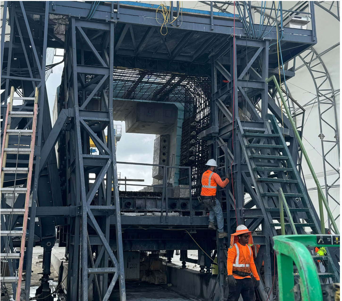
One of the casting molds for the signature bridge precast arch segments