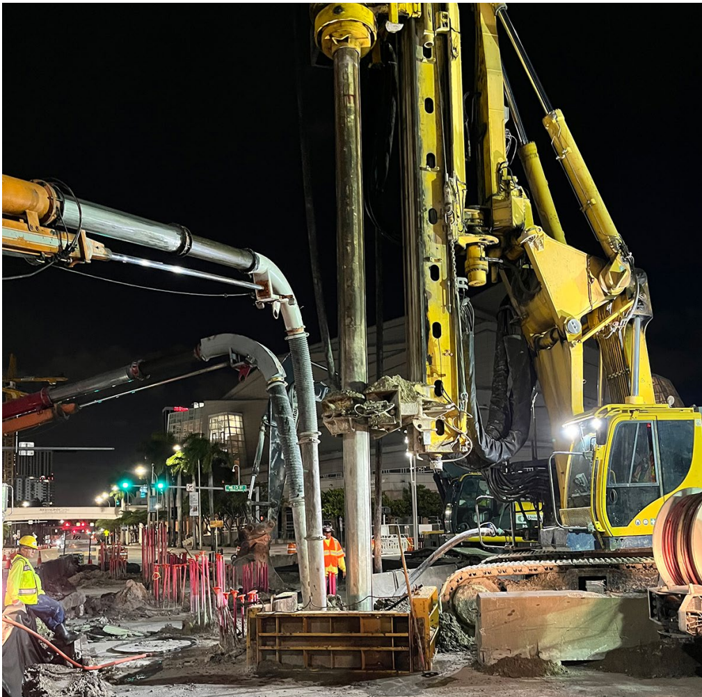
Installation of auger cast piles at Biscayne Boulevard for temporary support tower foundations