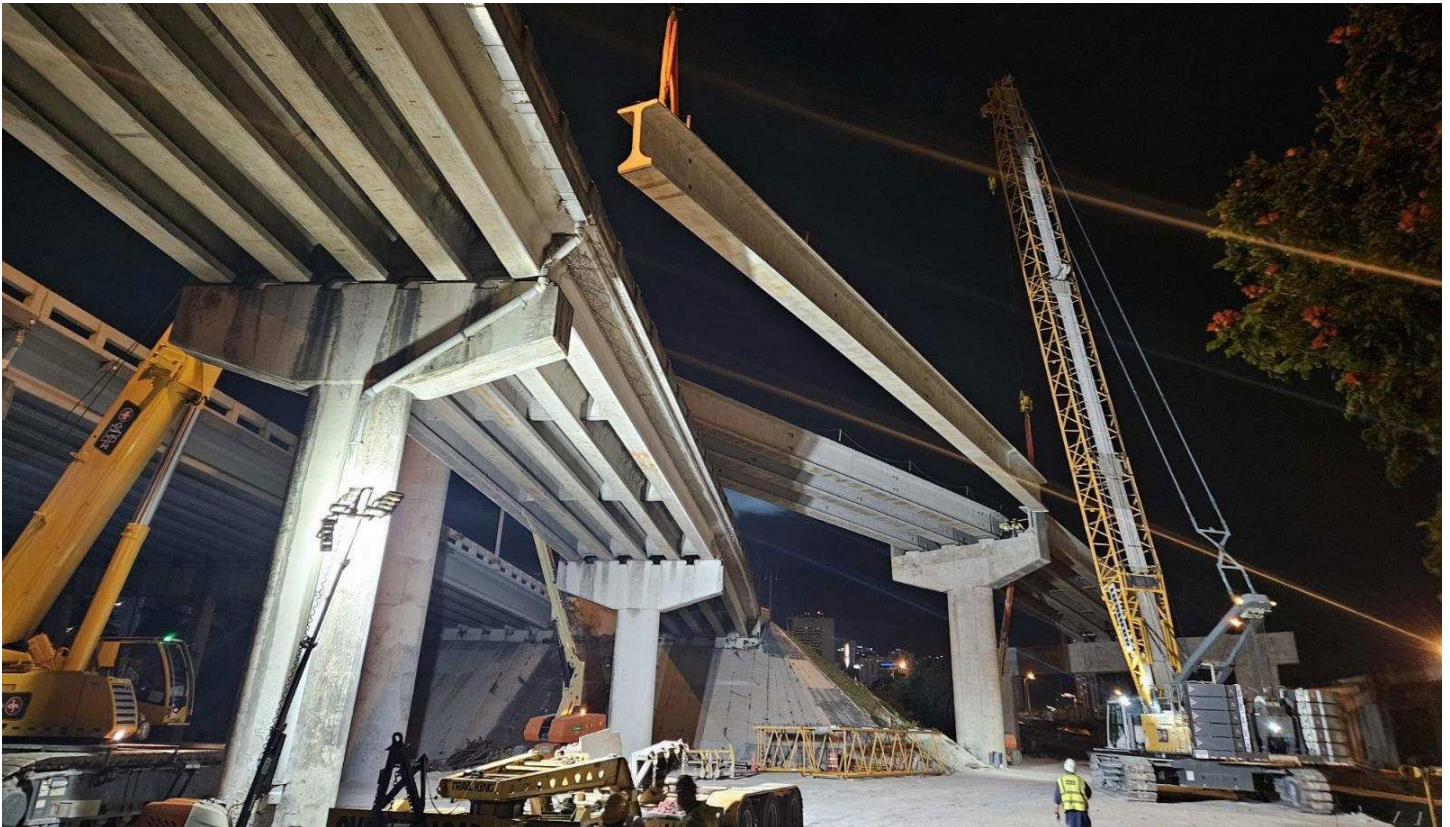
Installation of bridge beams for the new westbound I-395 ramp to southbound I-95