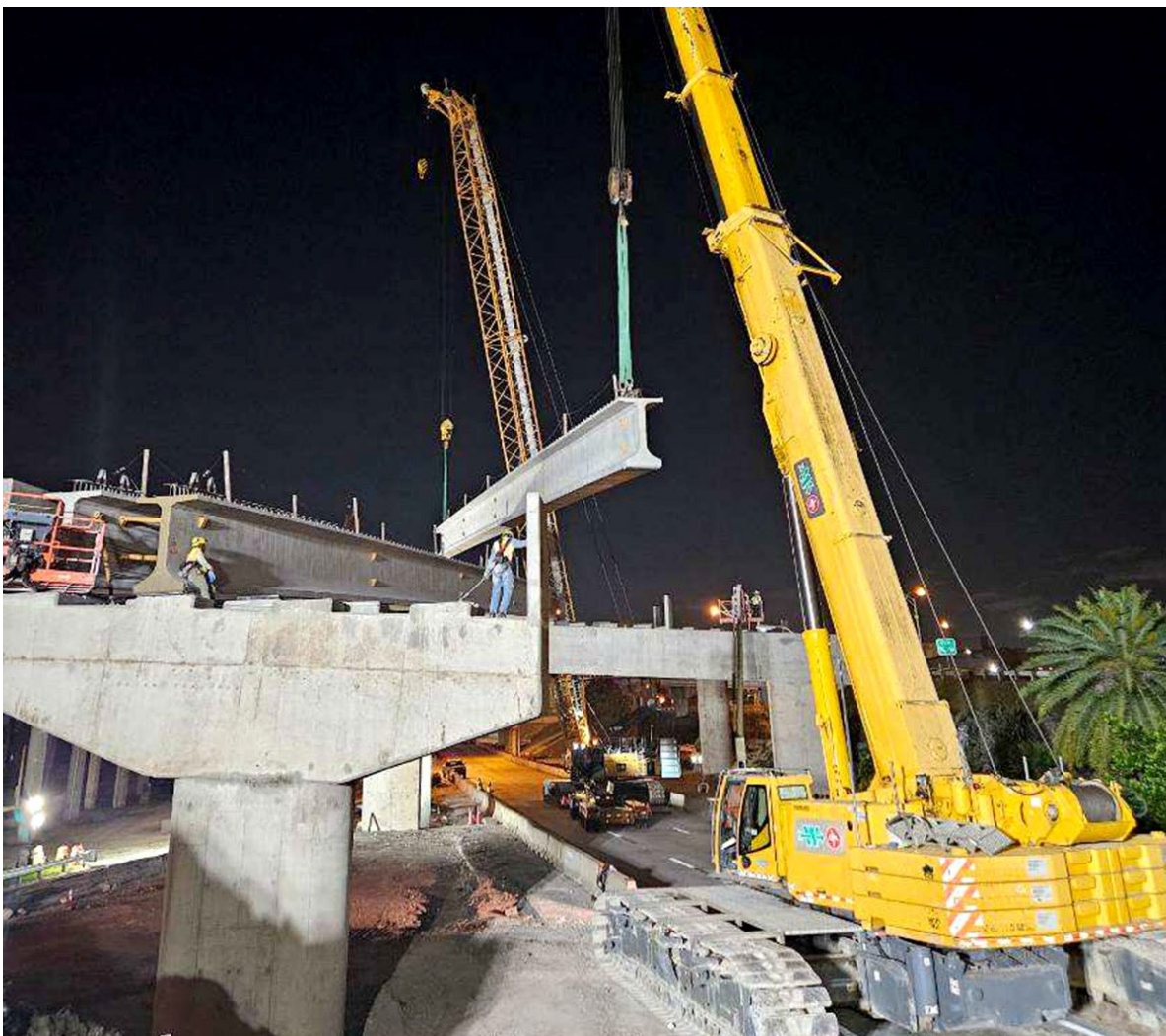
Erection of beams over southbound I-95 for the new westbound I-395 to southbound I-95 ramp bridges