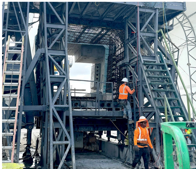
Arch reinforcing steel cage inside casting mold being prepared for concrete