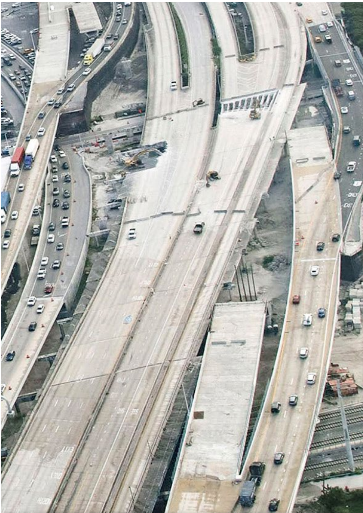
January 24, 2024