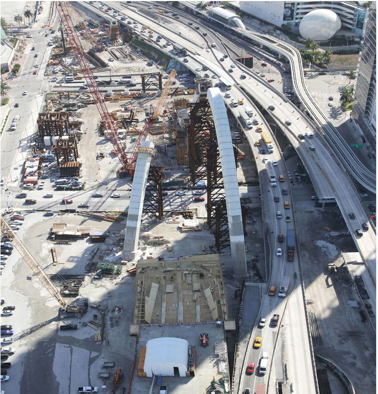
Arch and bridge construction at the I-395 signature bridge footprint