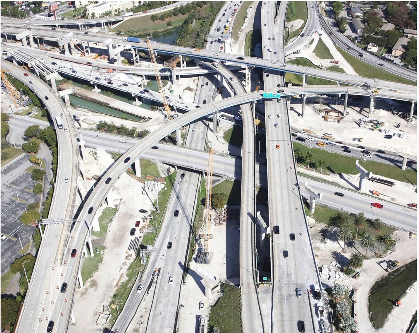
Ongoing bridge pier and cap construction at the interchange core