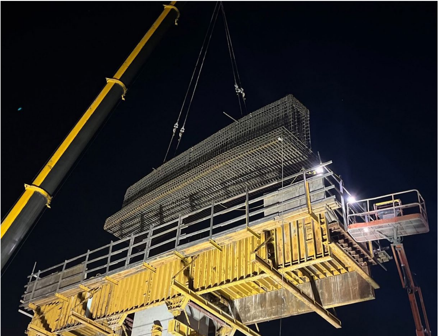
Installation of a reinforcing steel cage for a bridge pier cap at the SR 836/I-95/I-395 Interchange Core