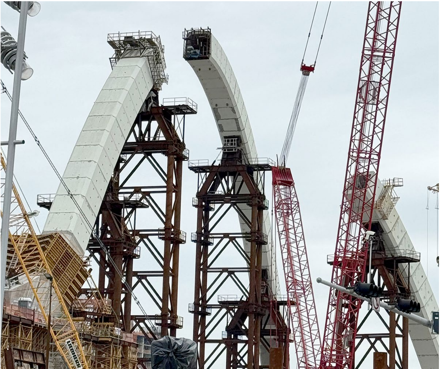
I-395 signature bridge arches under construction