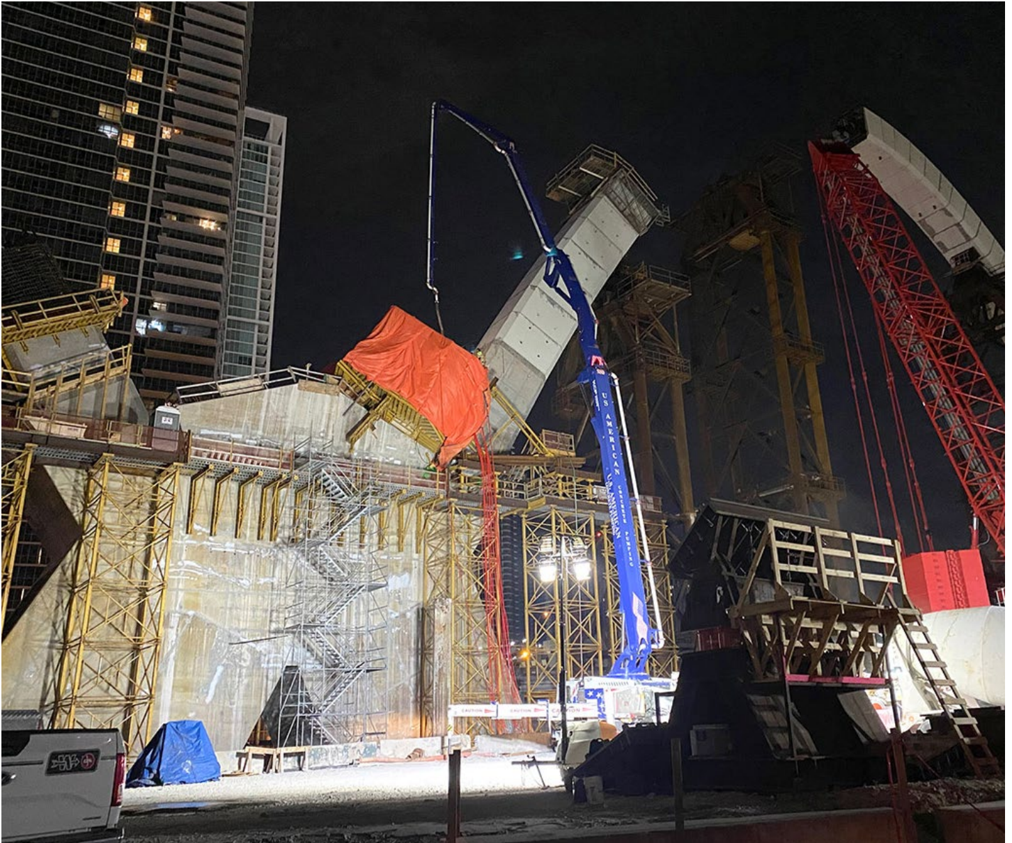
Concrete pour at the I-395 signature bridge center pier structure