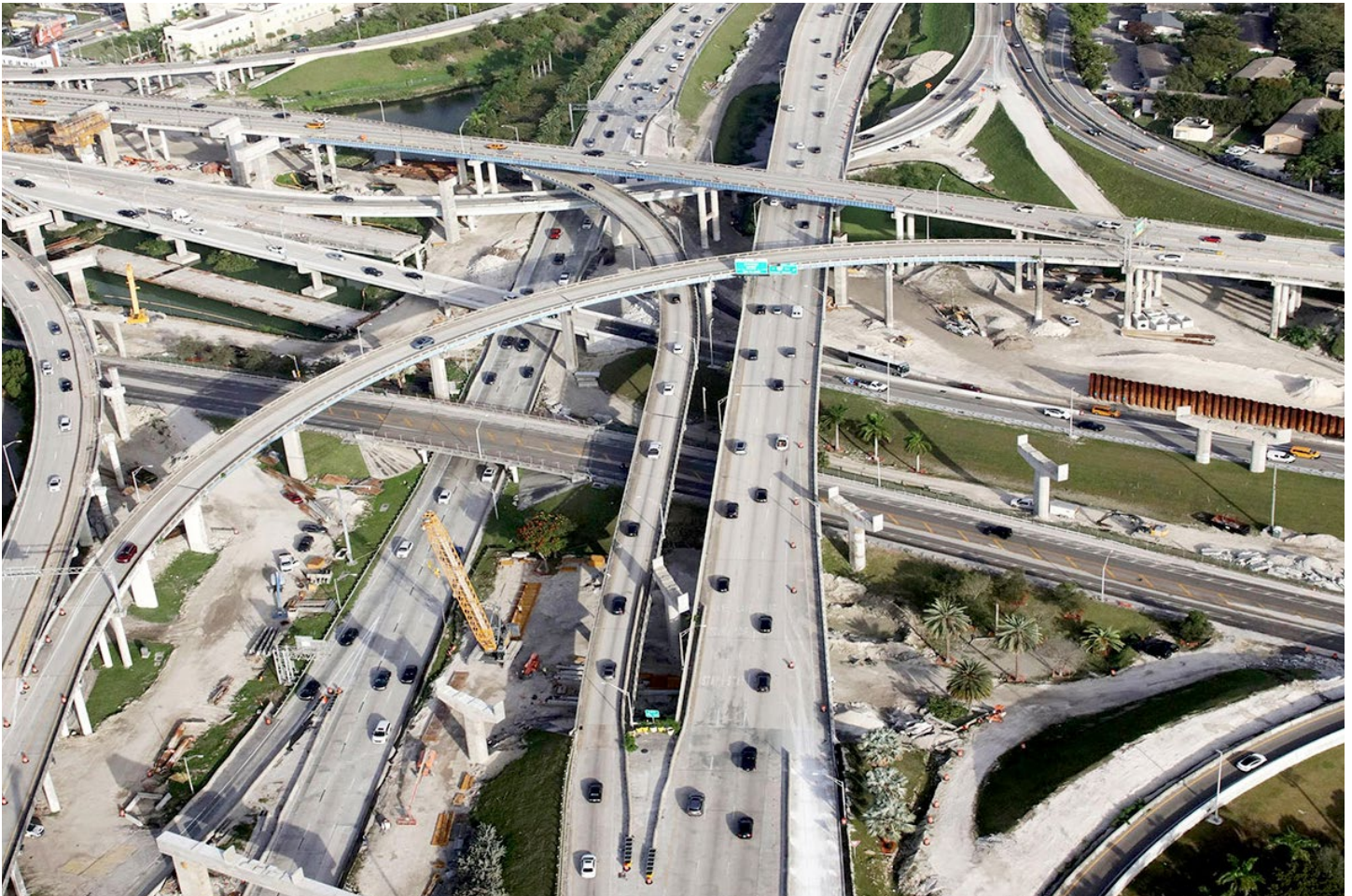
Foundation and pier construction at the interchange for the new SR 836 double-decked section