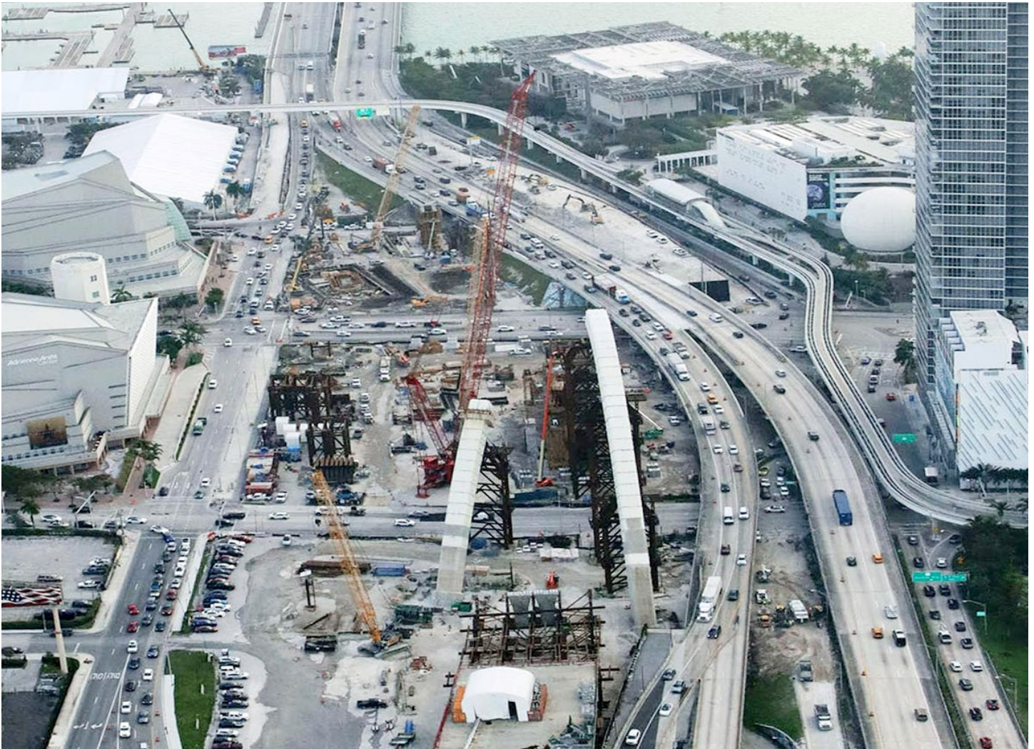
Ongoing work at the I-395 signature bridge site