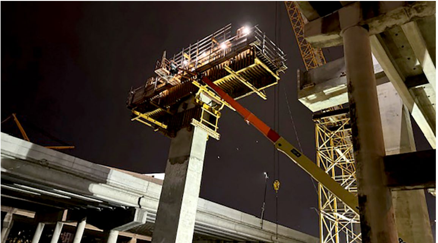
Pier and cap construction for the new SR 836 double-decked section