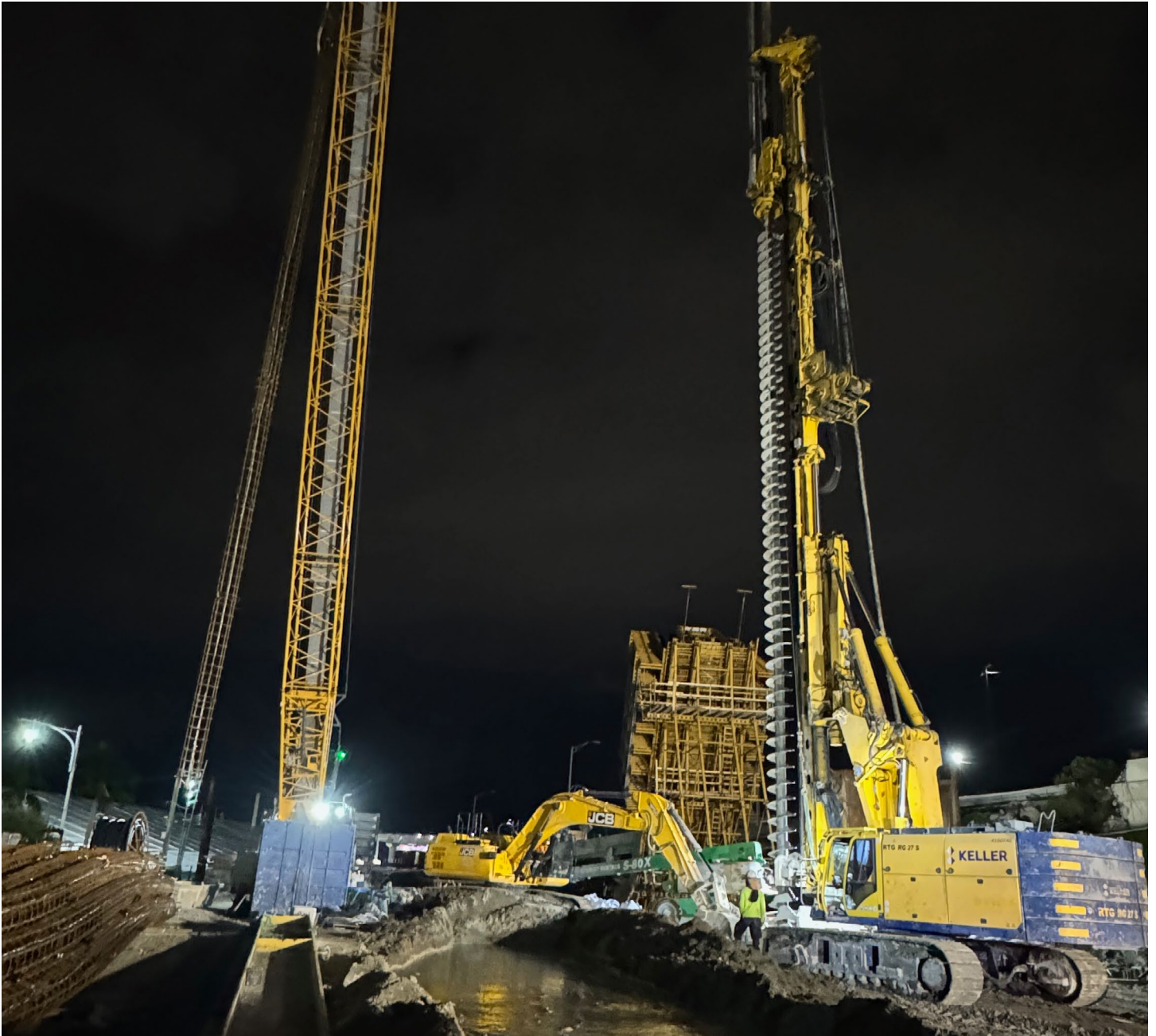
Auger Cast Pile installation adjacent to Biscayne Boulevard