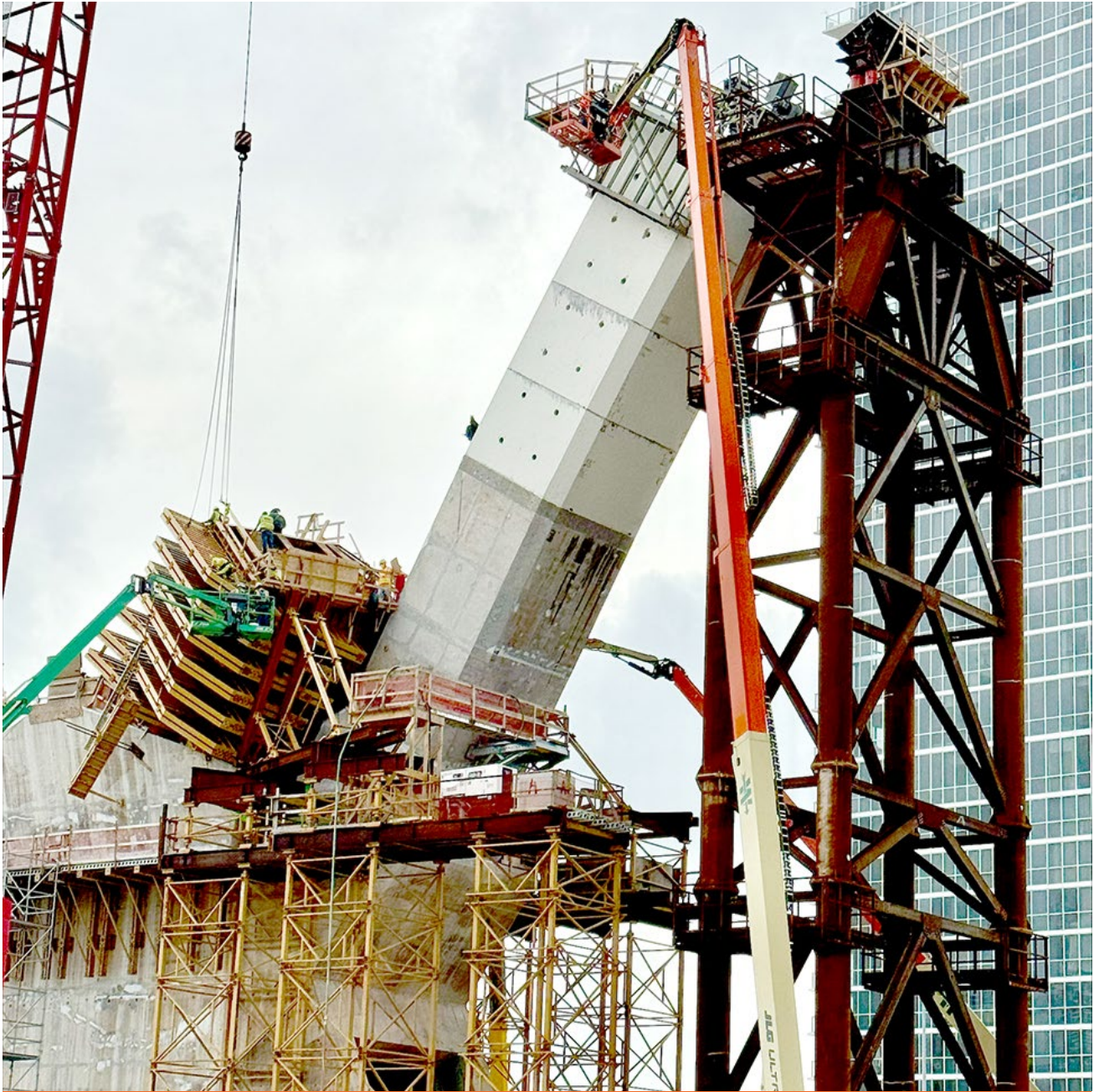
Ongoing work at the I-395 signature bridge center pier structure