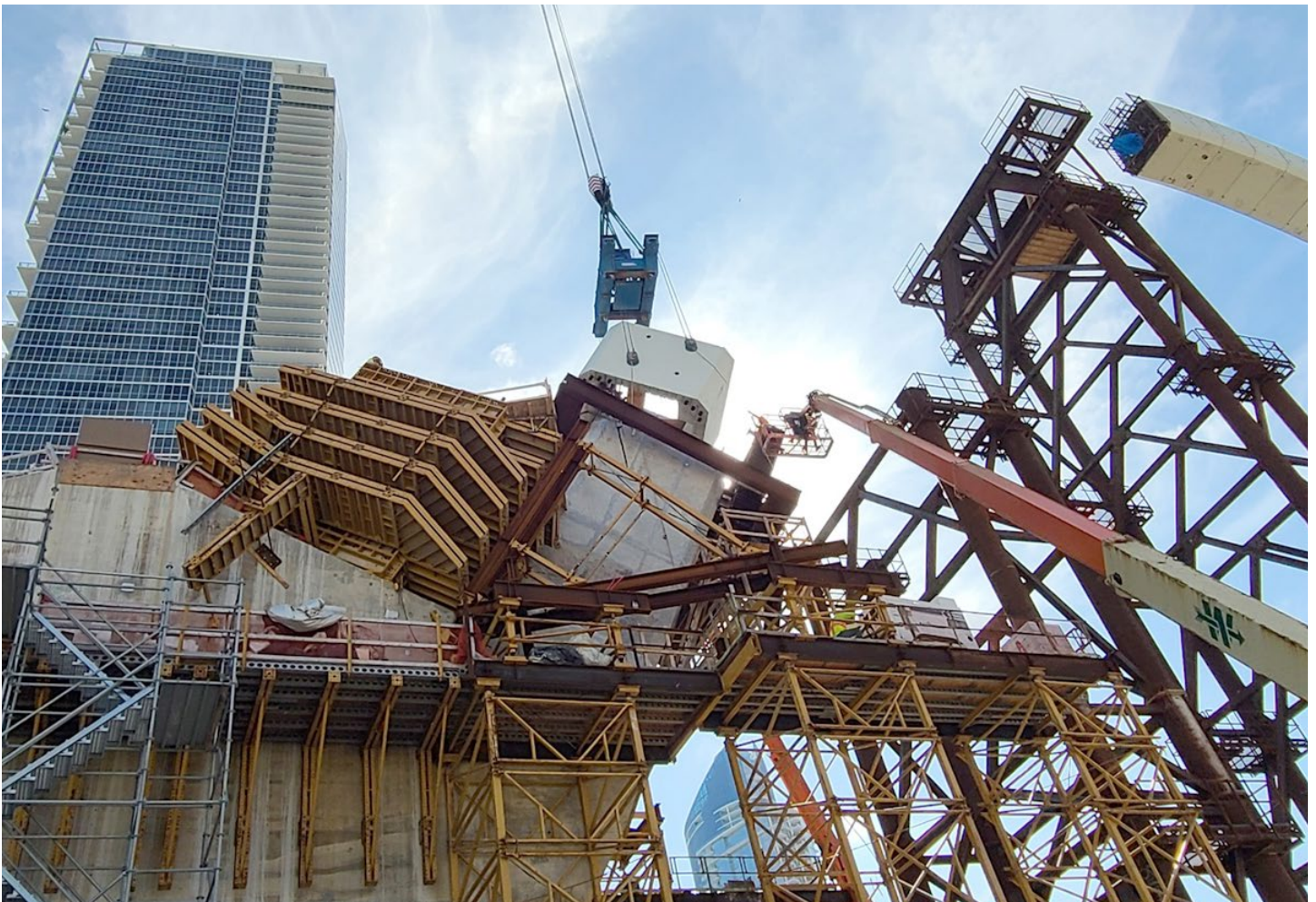
Installation of a signature bridge precast arch segment at the center pier structure