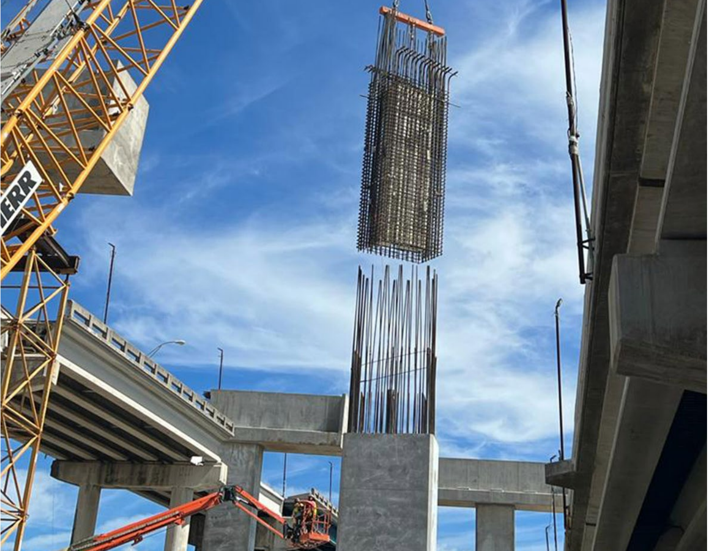
Pier construction for the new SR 836 double-decked roadway