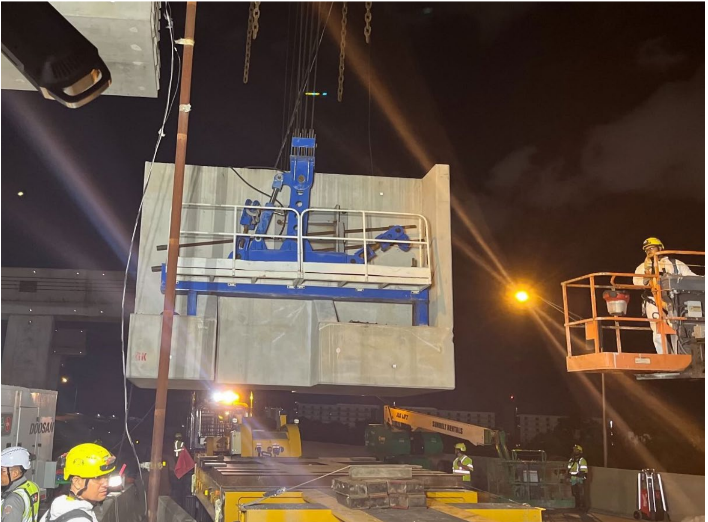
Installation of pier cap on SR 836 east of NW 17 Avenue.