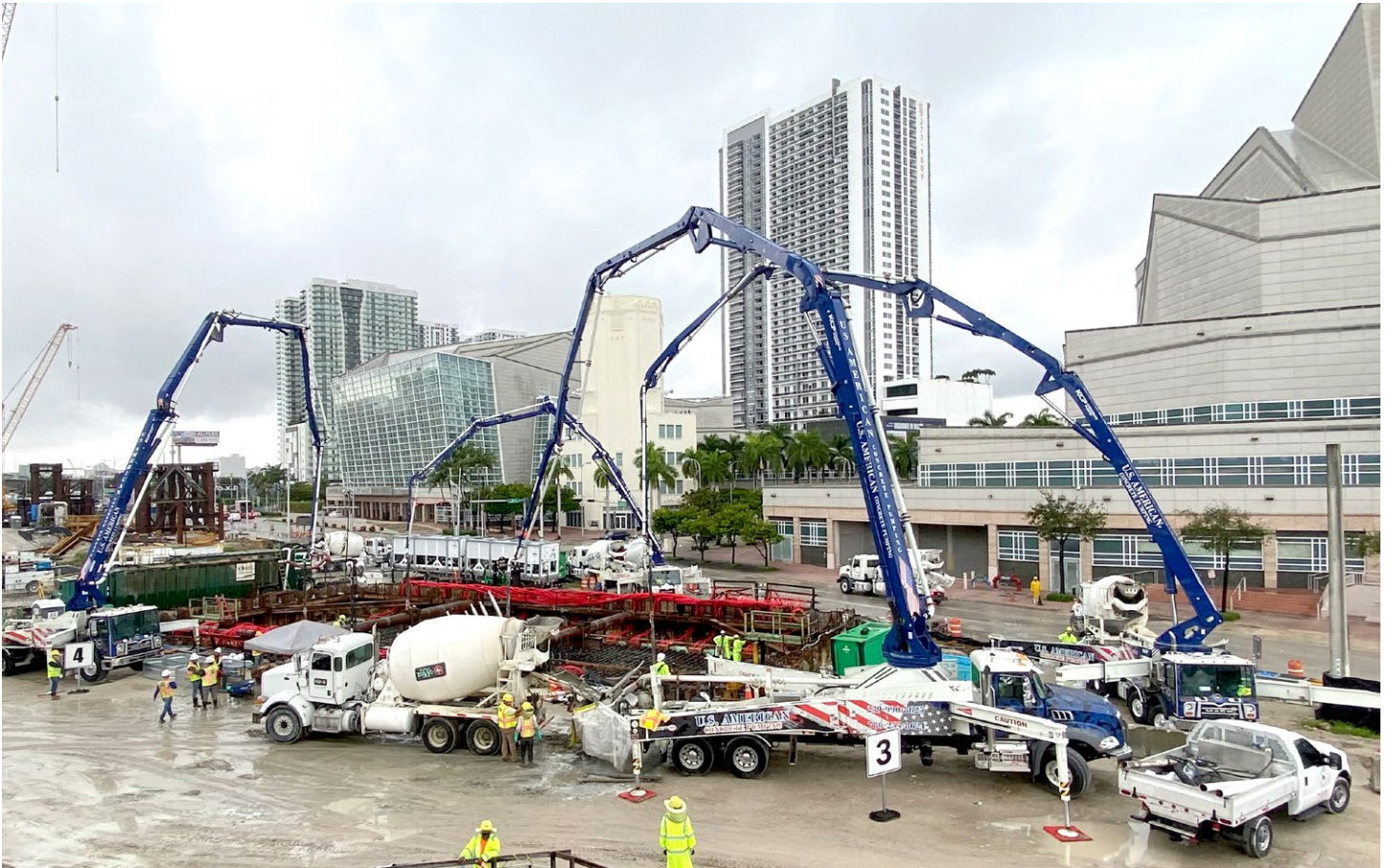
Concrete pour for the footer at one of the signature bridge arches.