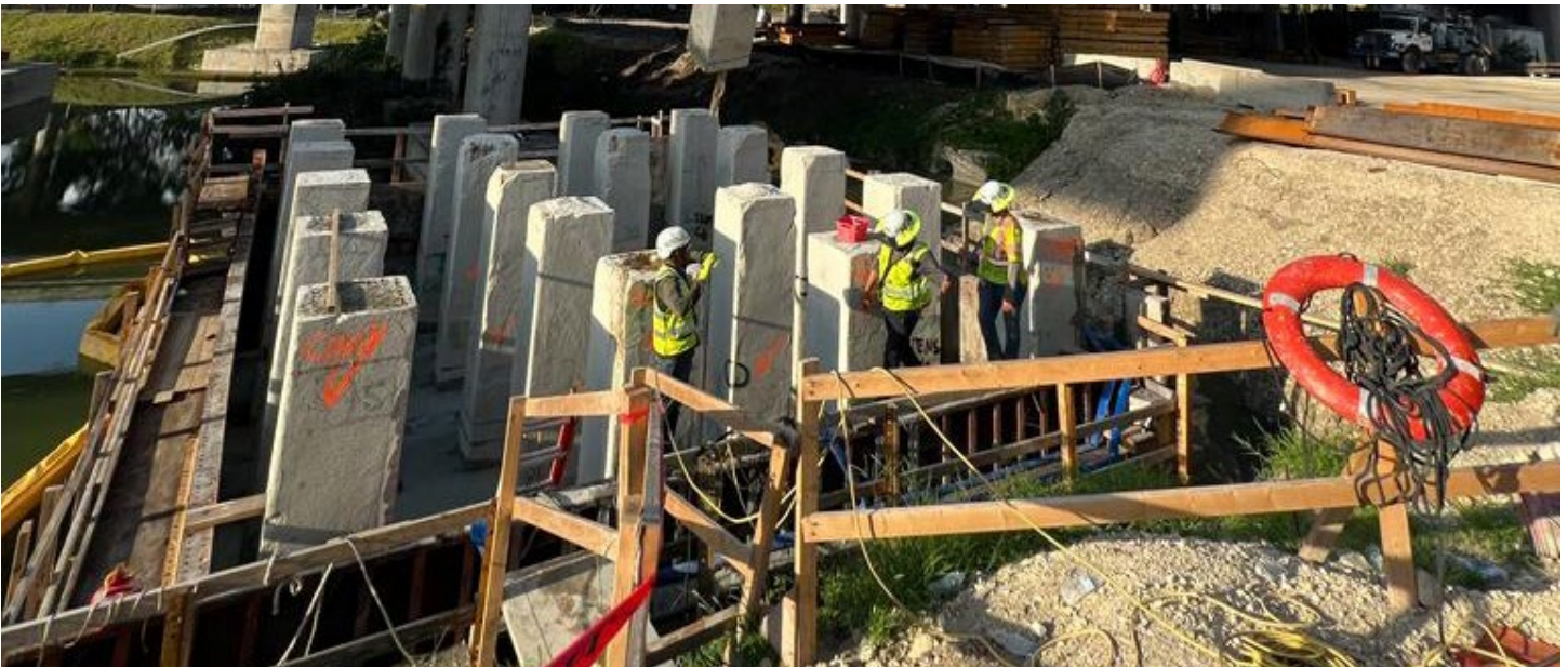
Foundation work for the new SR 836 double-decked roadway at the core of the SR 836/I-95/I-395 Interchange