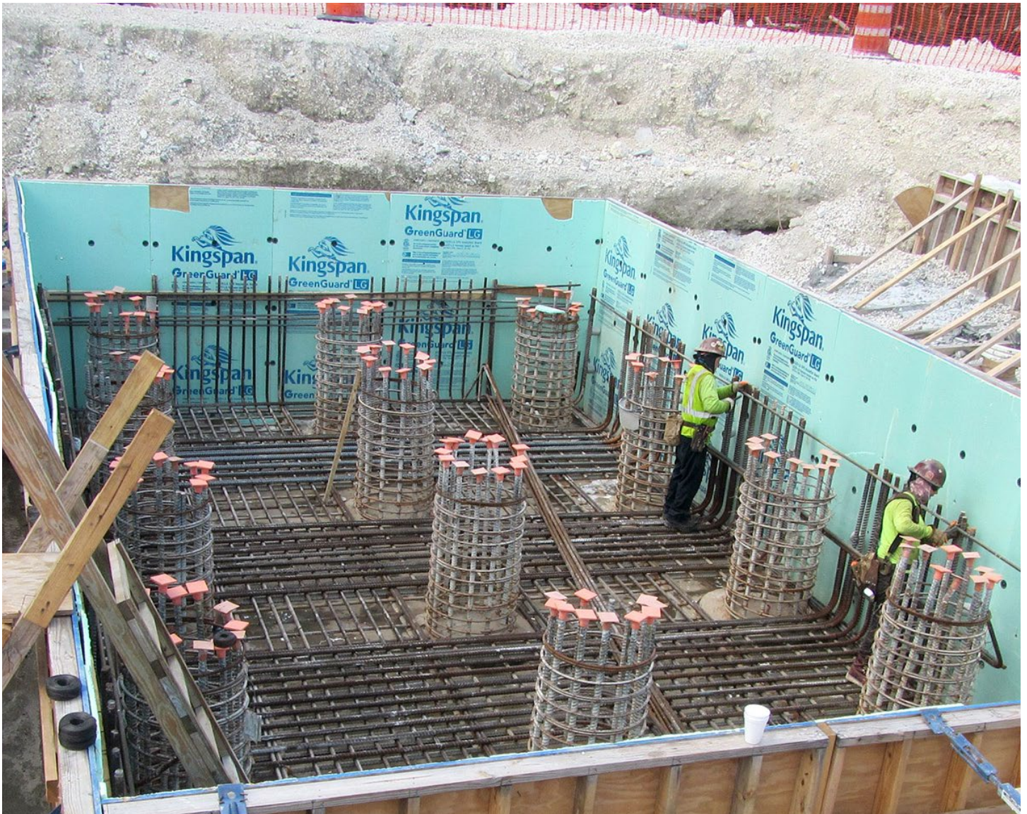
Crews installing reinforcing steel for the transition pier footer connecting the I-395 signature bridge with the segmental bridges