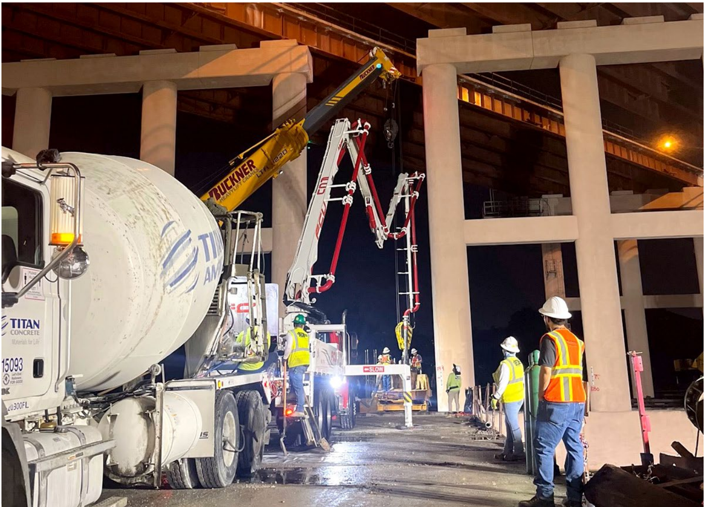
Concrete foundation pour at the Miami River under SR 836