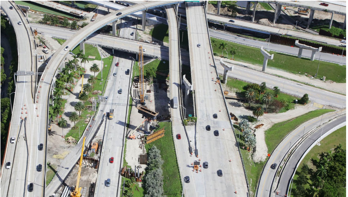
Foundation and pier construction for the new westbound I-395 ramp to southbound I-95 at the core of the interchange