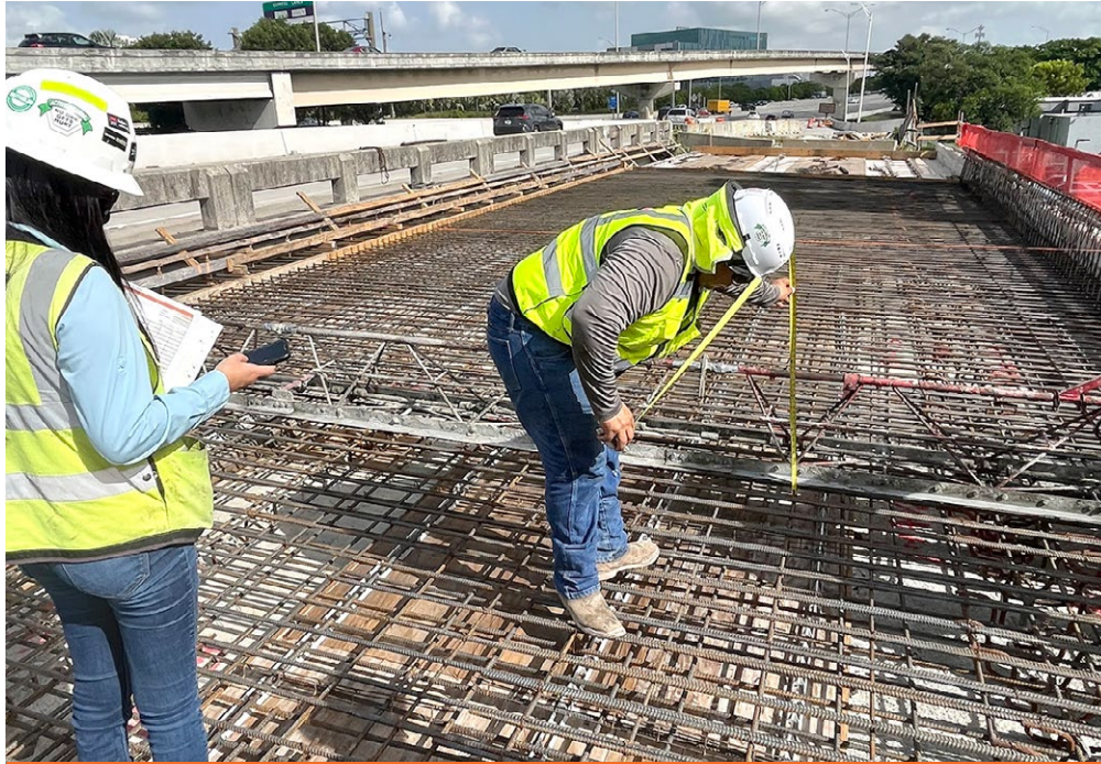
Concrete deck pour preparation for a new ramp bridge over NW 17 Street