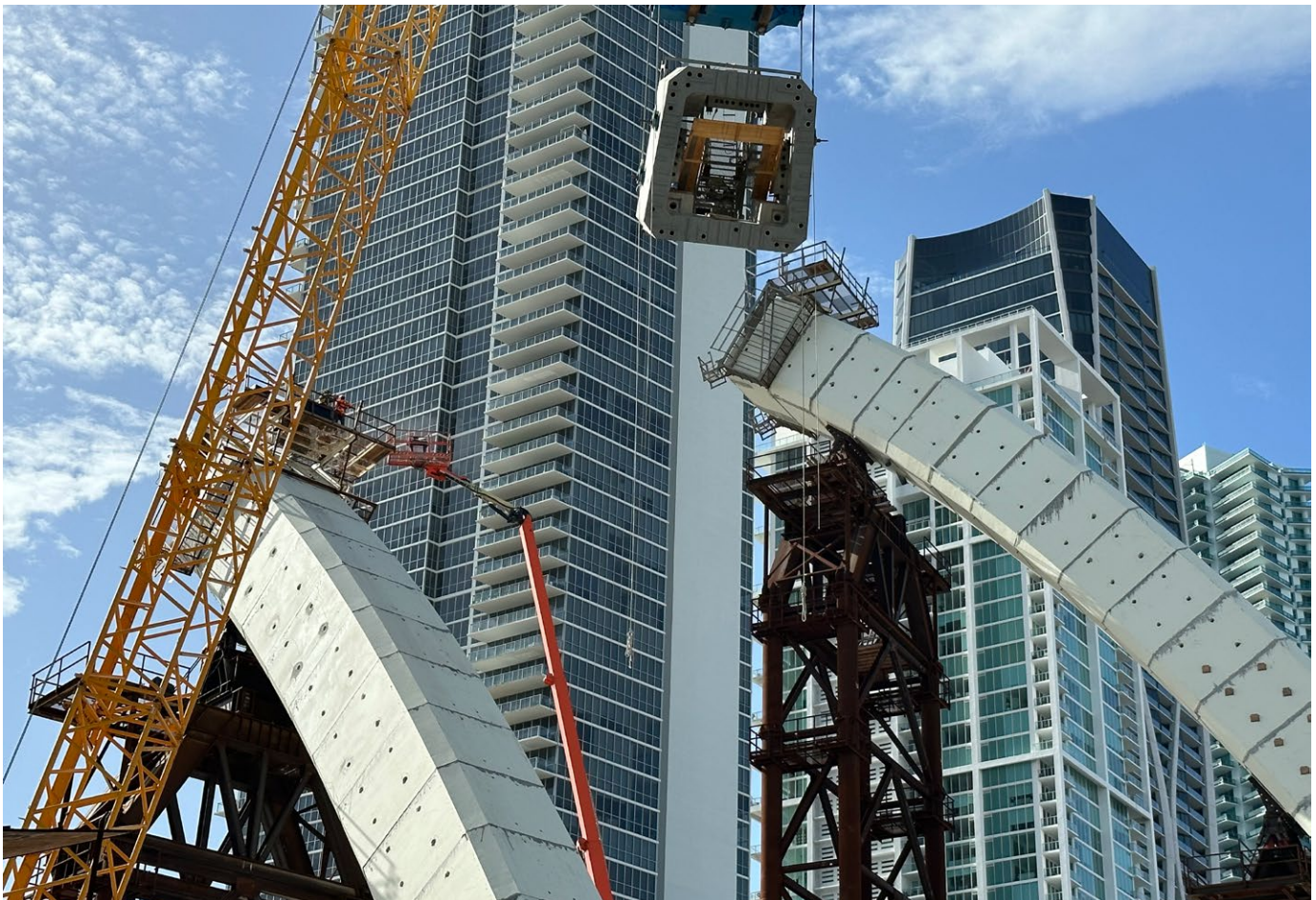
Installation of a precast arch segment for the I-395 signature bridge