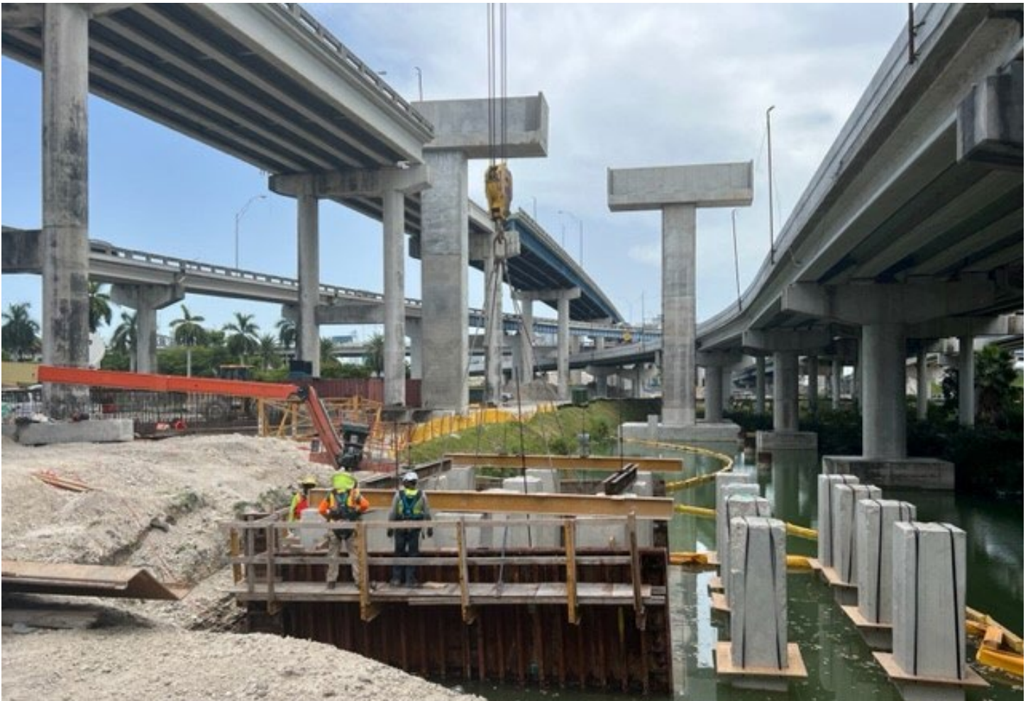
Foundation construction at the core of the Interchange