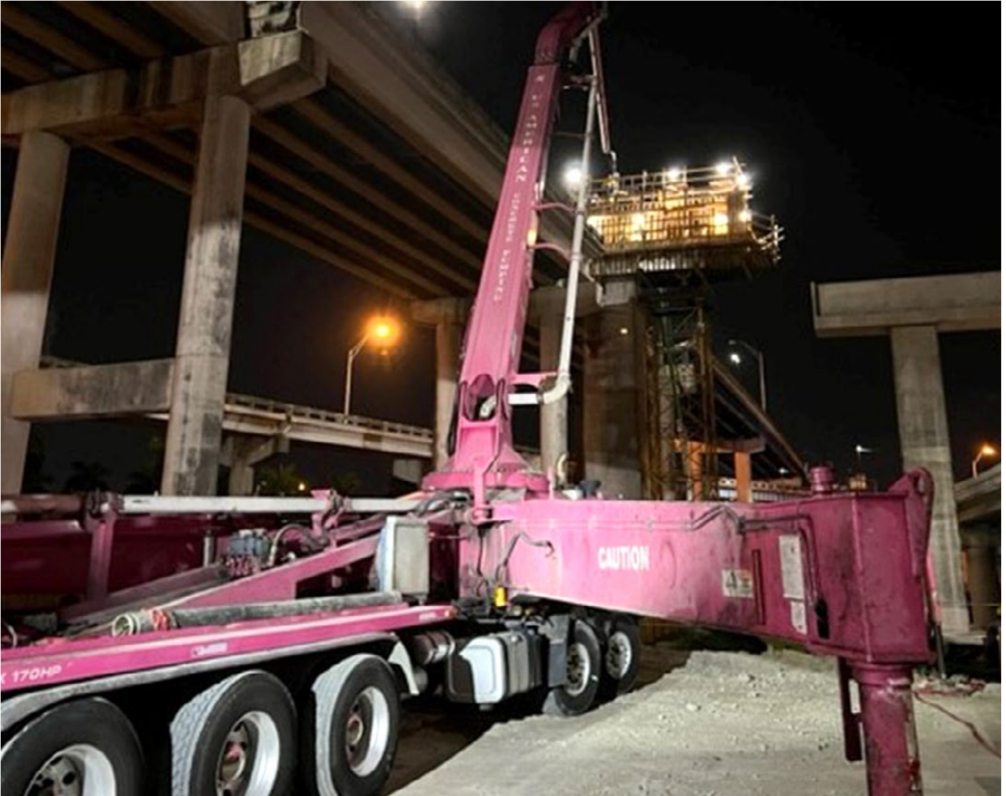
Concrete pier cap pour at the core of the interchange