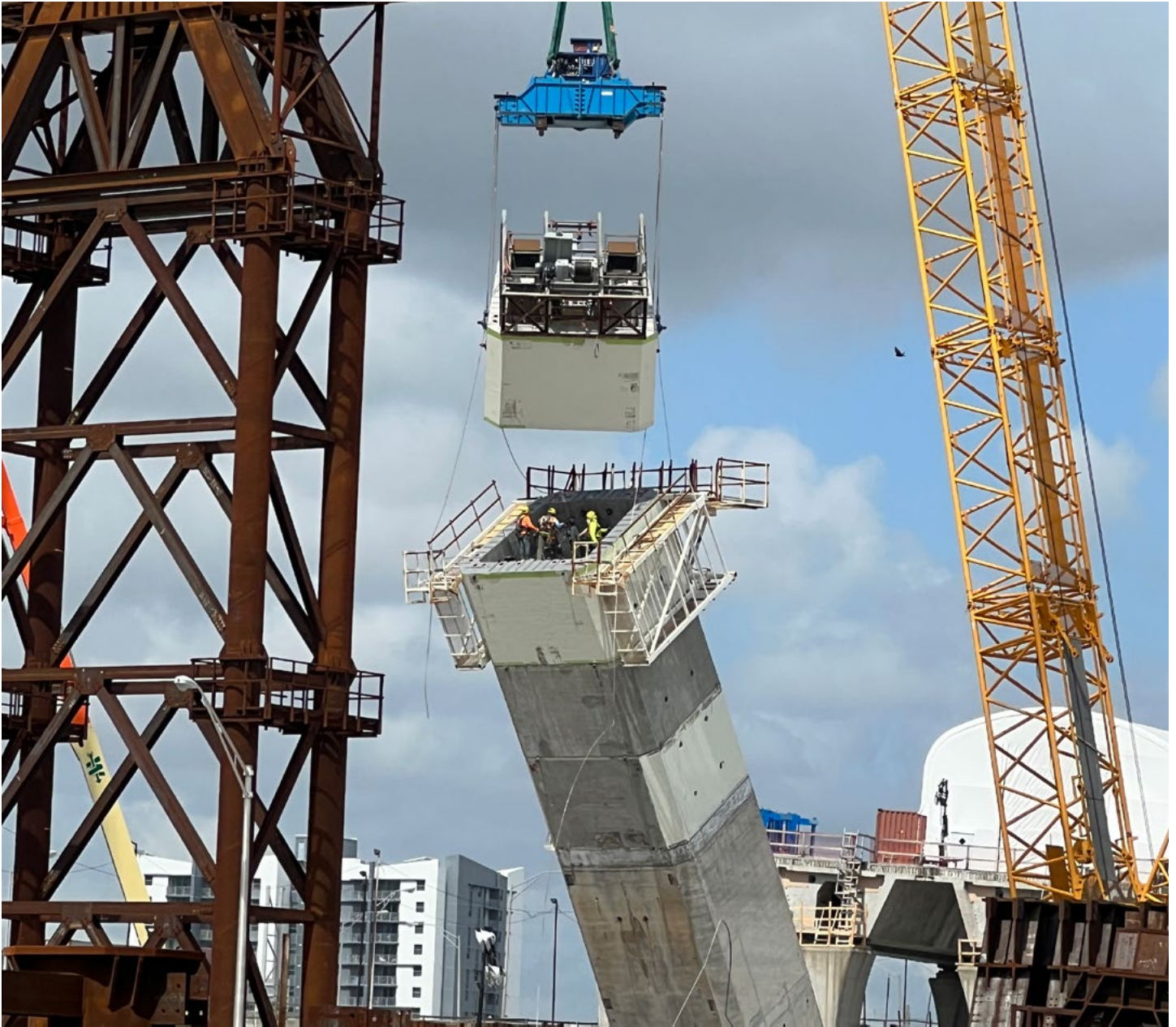
Installation of precast arch segments west of NE 2 Avenue