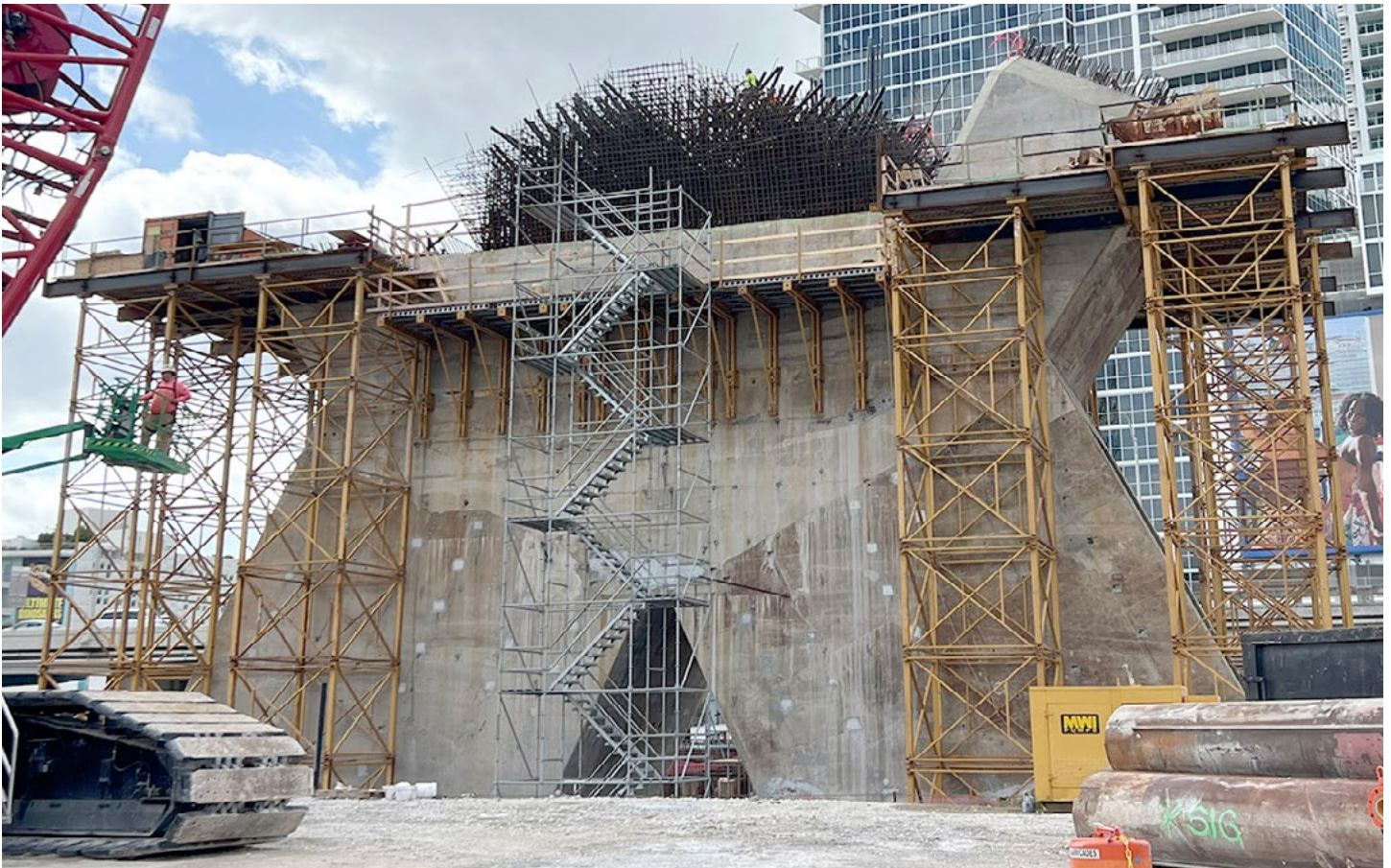
Newly poured arch pedestal for the I-395 signature bridge shown on the top right side of the structure