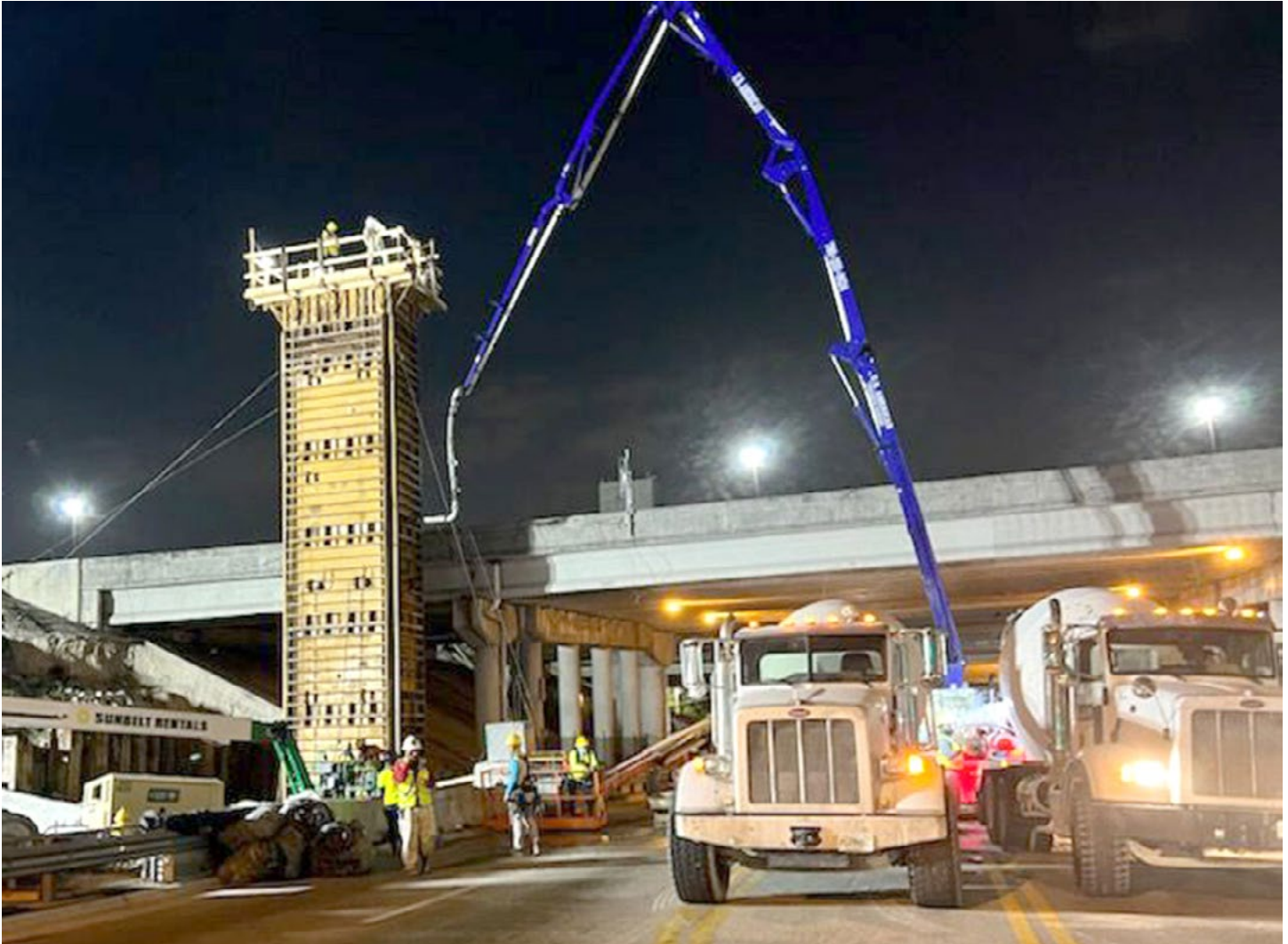
Concrete pour for new SR 836 Pier adjacent to NW 7 Avenue