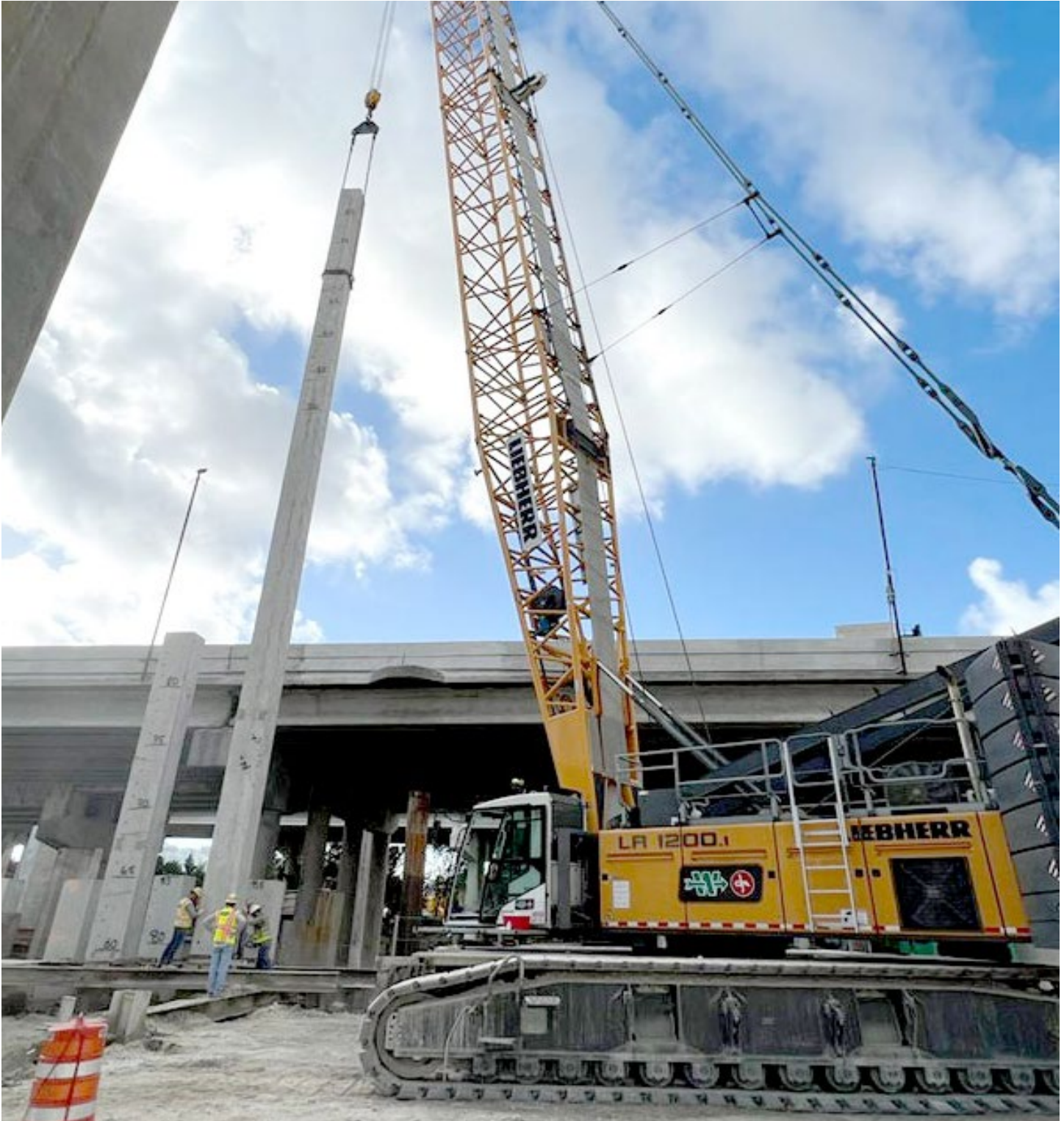
Concrete pile driving for bridge foundations at the core of the SR 836/I-395/I-95 Interchange