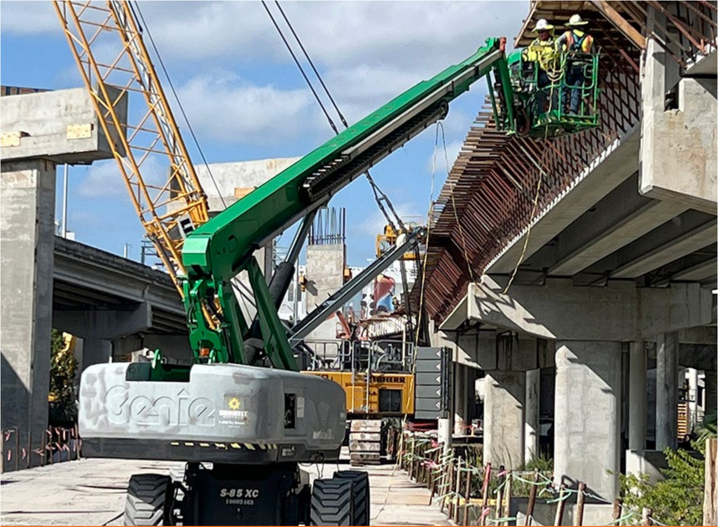
Crews working on bridge overhangs at the new eastbound SR 836 connection to I-395