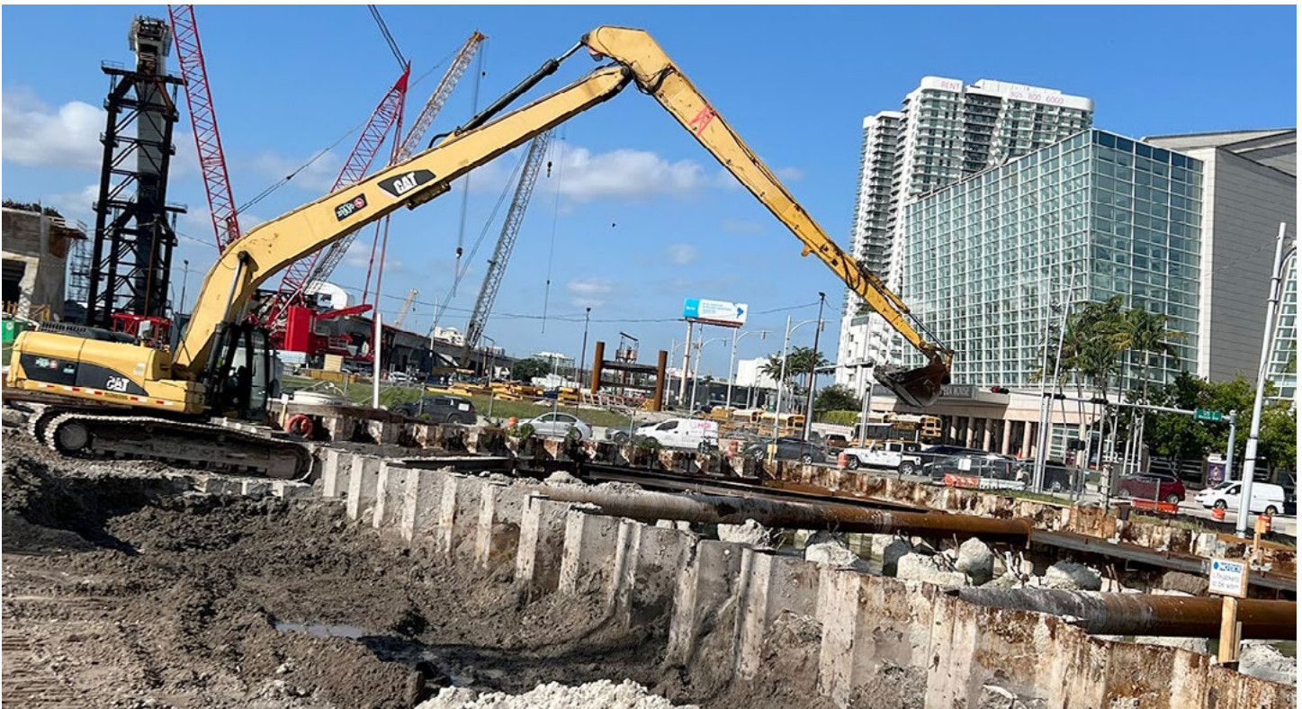
Excavation at one of the I-395 signature bridge arch footers