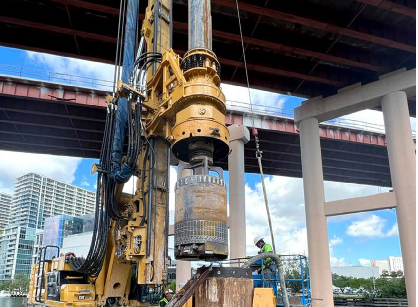
Drilled shaft foundation construction for the SR 836 double decked section