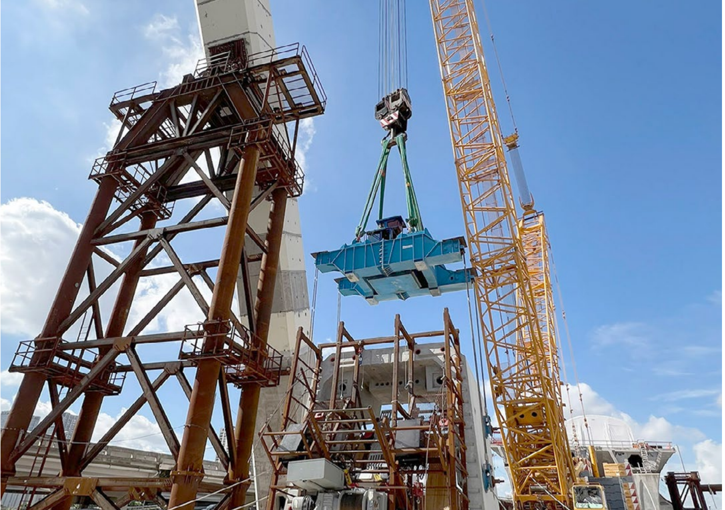
Installation of precast arch segment for the I-395 signature bridge