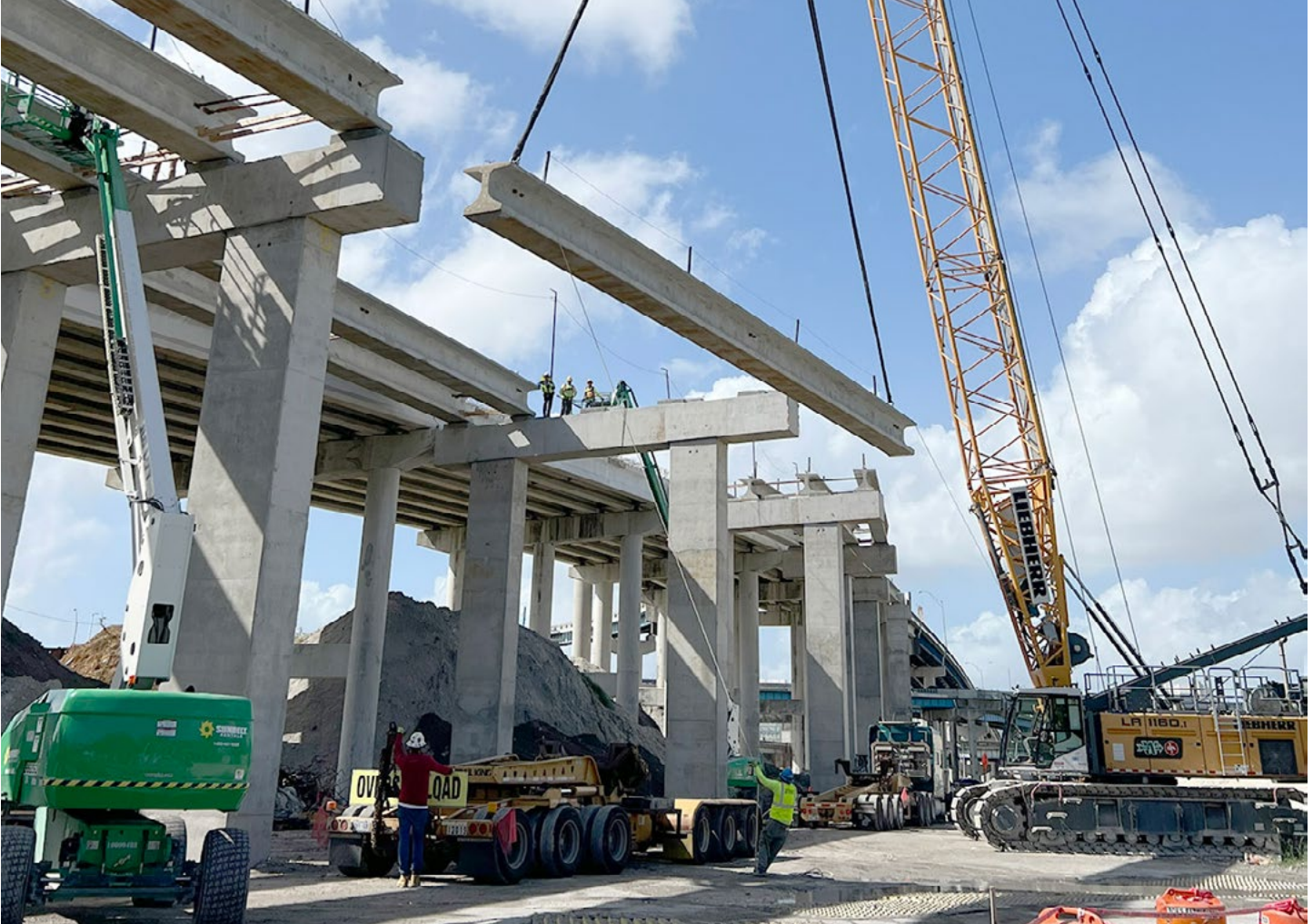
Installation of I-395 bridge beams just east of the interchange core