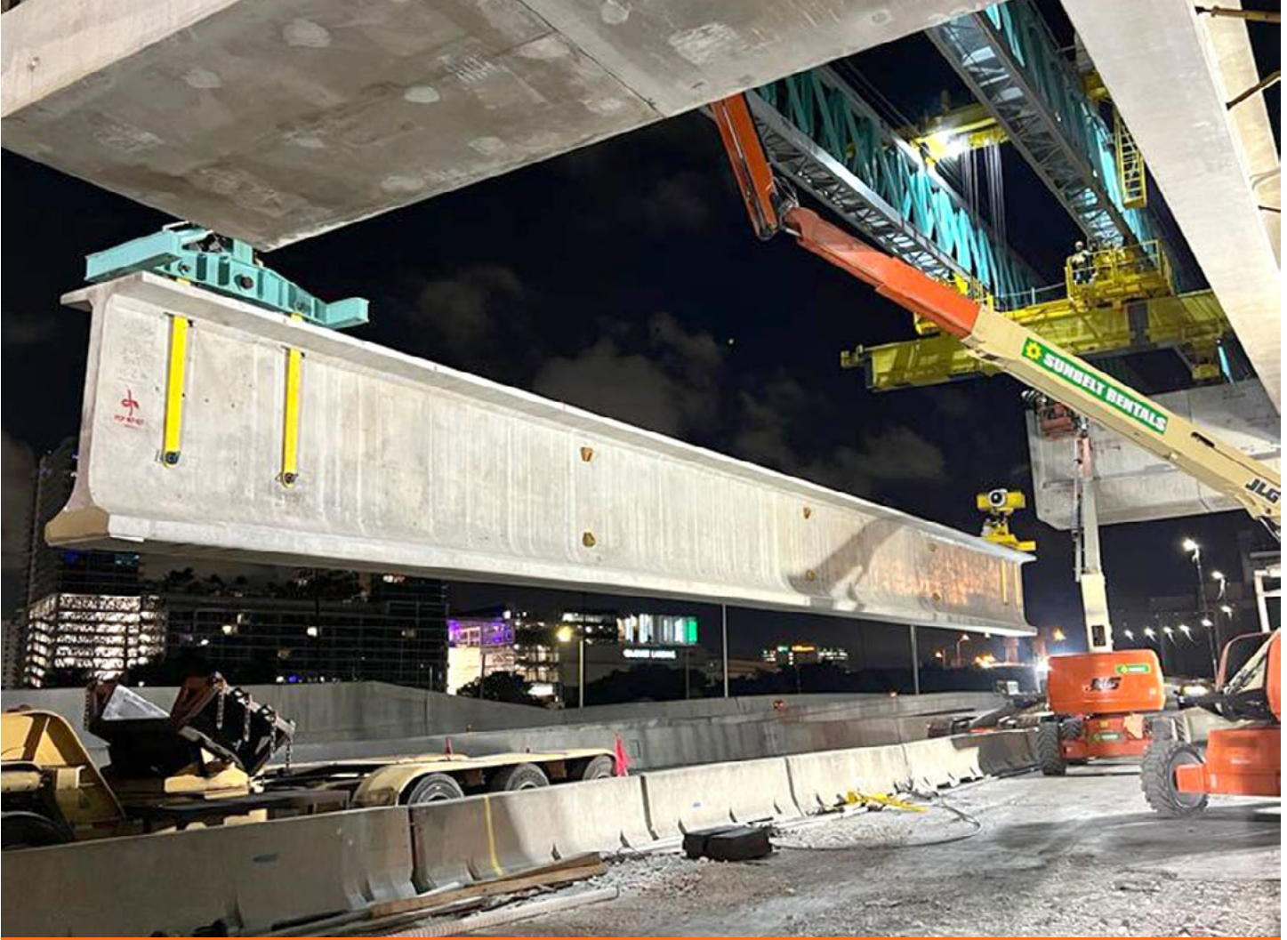
Installation of SR 836 beam using the 488-foot lifter just west of NW 17 Avenue