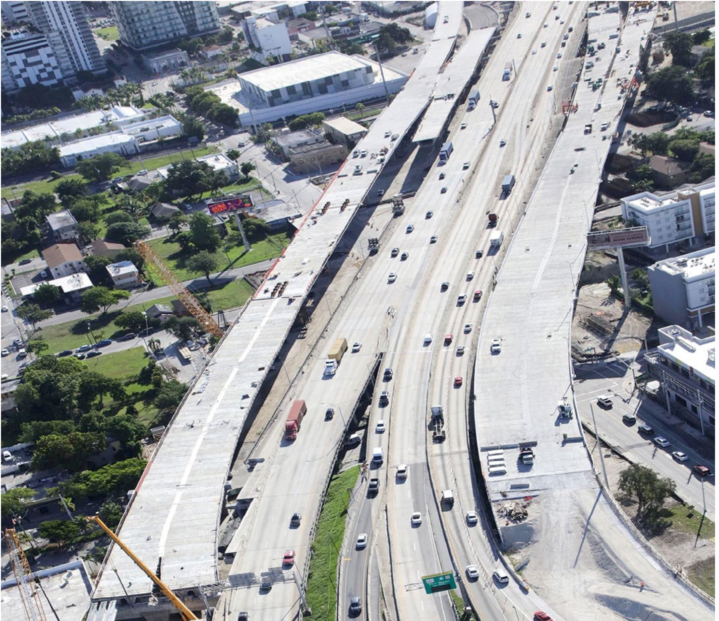
I-395 Segmental bridge construction between NW 3 Avenue and North Miami Avenue