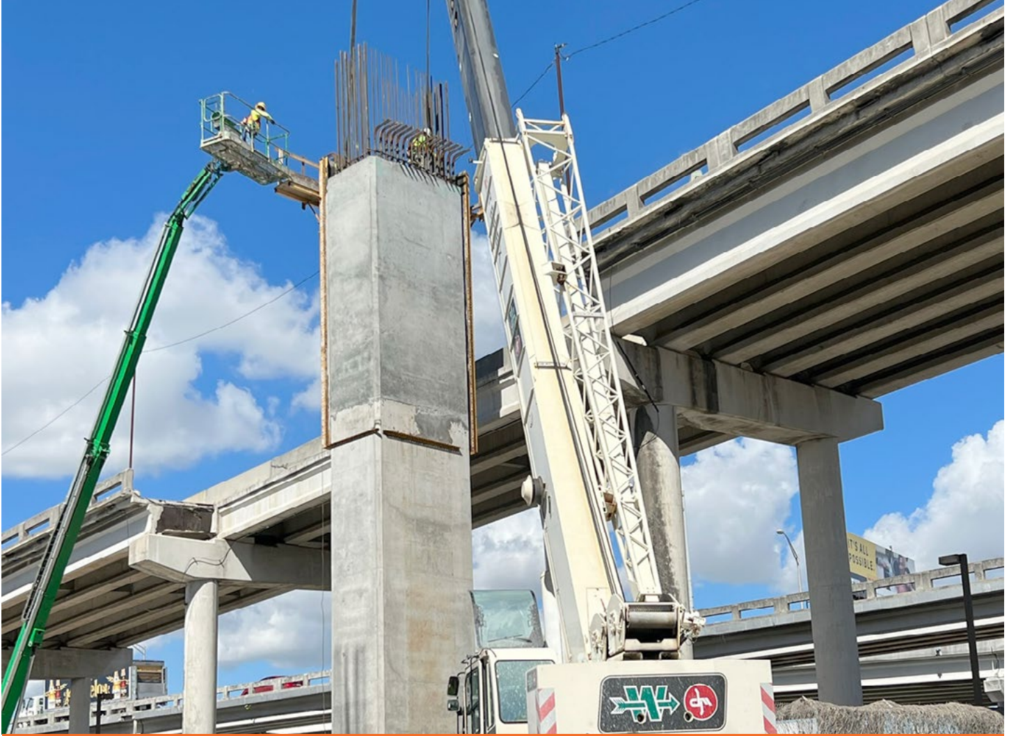
Pier construction for the SR 836 double decked roadway at the core of the interchange