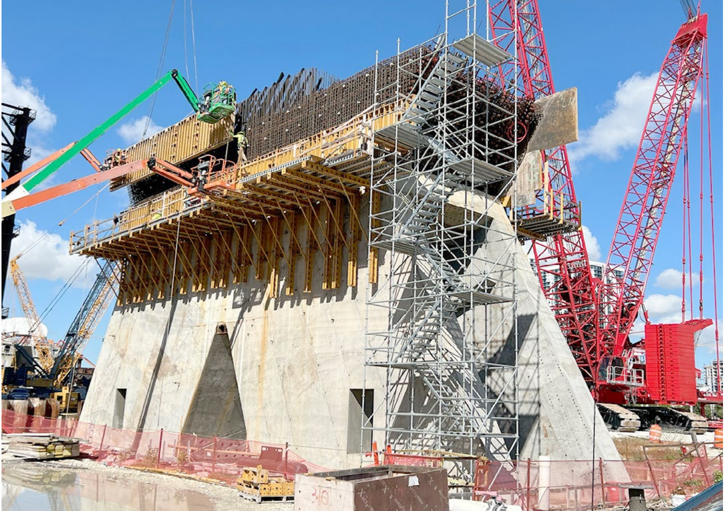
Crews placing forms for concrete placement at the signature bridge center pier