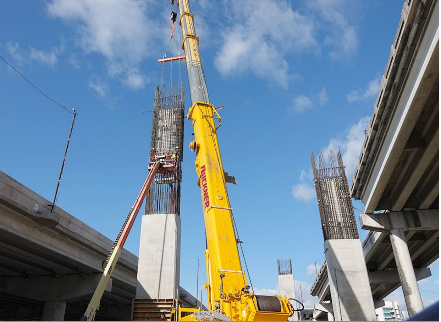
Crews working on a new pier at the SR 836/I-95/I-395 Interchange core.