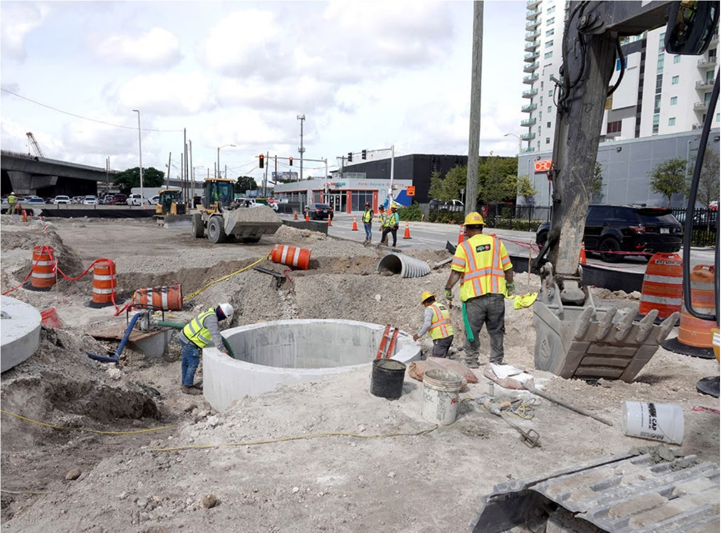
Drainage work at the future access road to the new westbound I-395 entrance ramp.