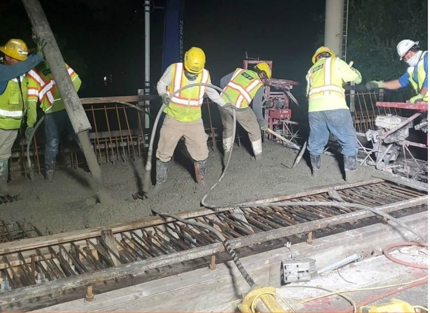
Crews placing concrete for bridge widening on eastbound SR 836 between NW 10 Avenue and I-95.