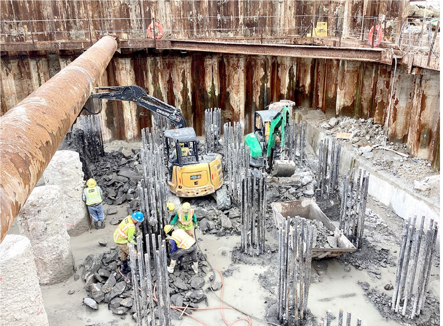
Crews chipping piles in preparation for installation of reinforcing steel at one of the I-395 signature bridge arches.