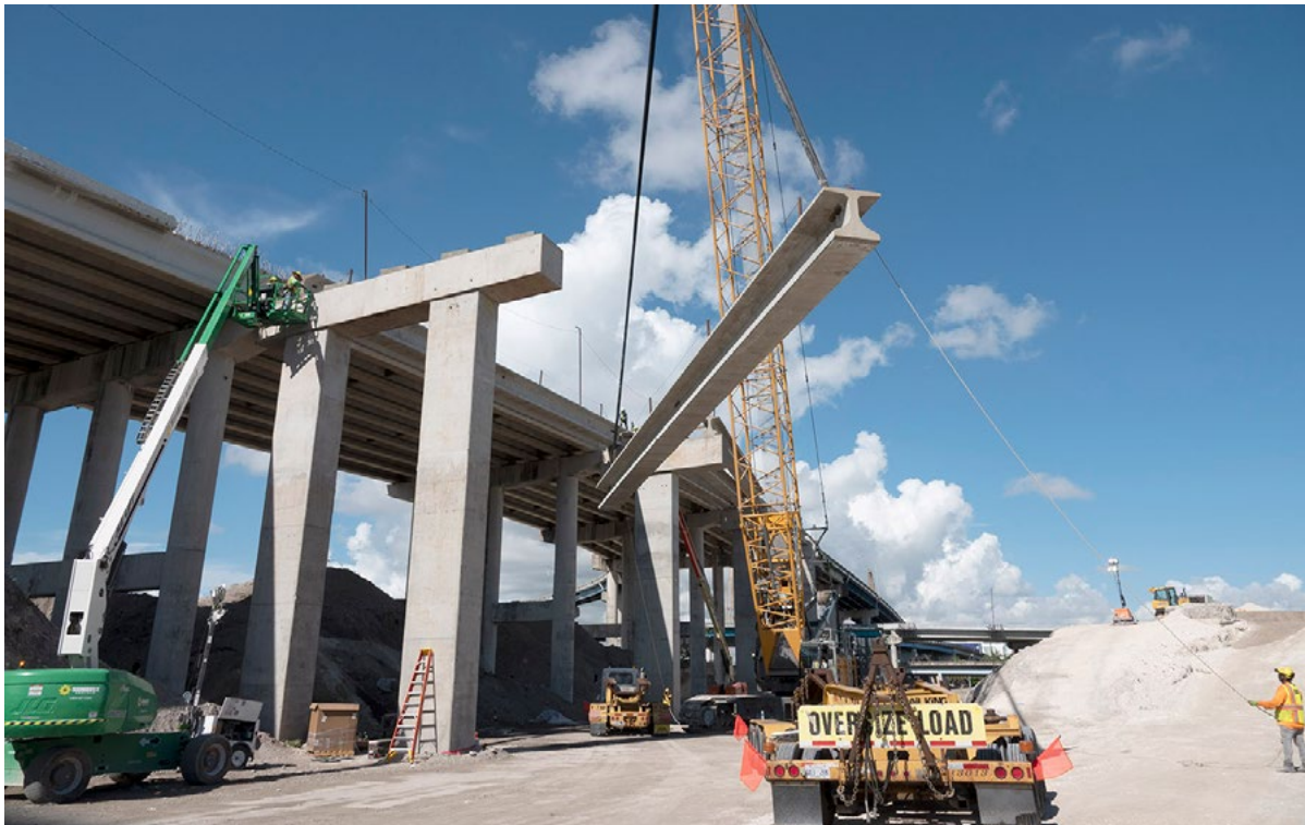
Installation of bridge beams at I-395 just east of I-95