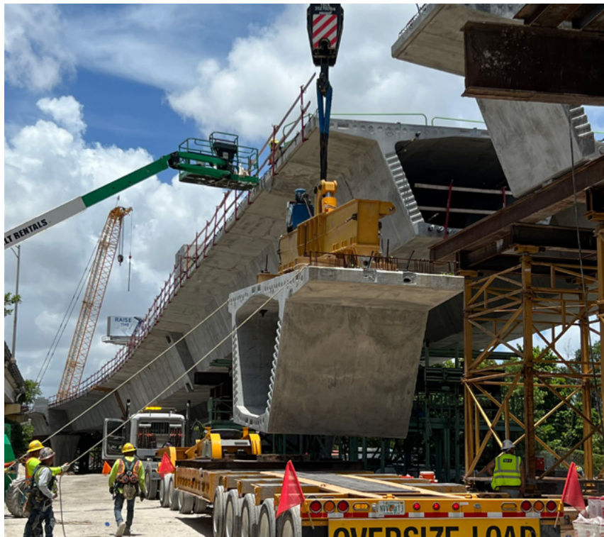
Erection of bridge segment for the new westbound I-395 bridge just north of NW 14 Street and east of NW 3 Avenue