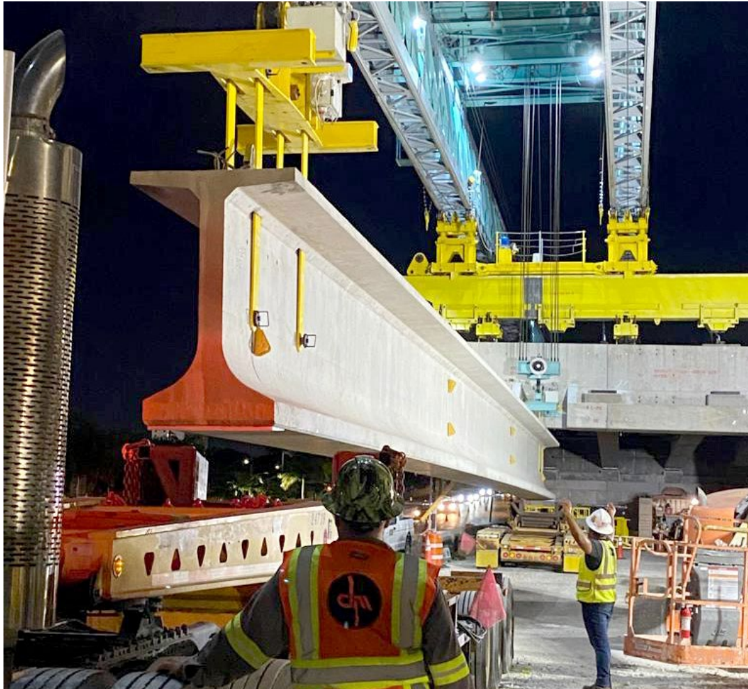
Installation of SR 836 bridge beams using the beam and cap segment lifter