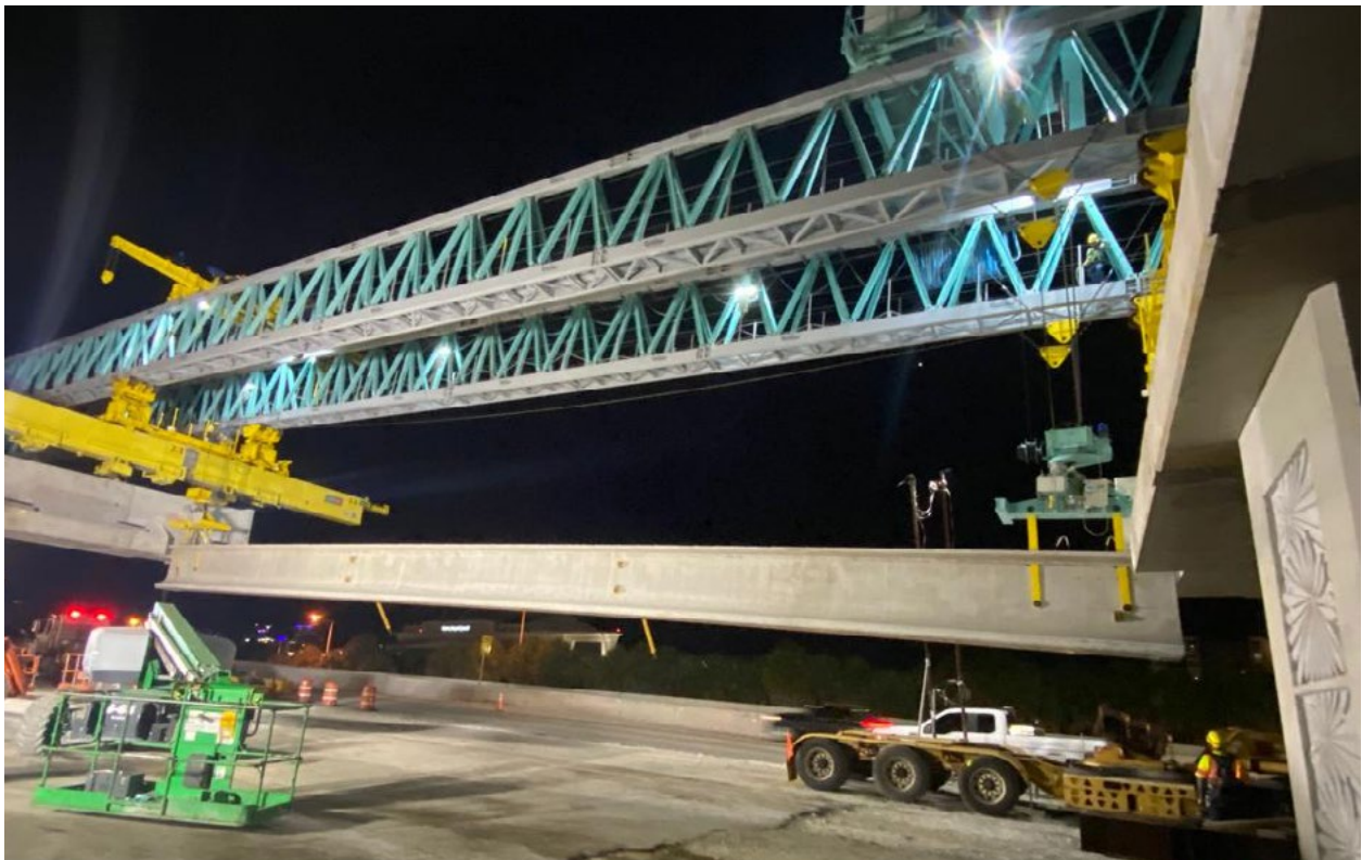
Installation of first bridge beam for the new SR 836 second level roadway with the specialized bridge cap and beam lifter