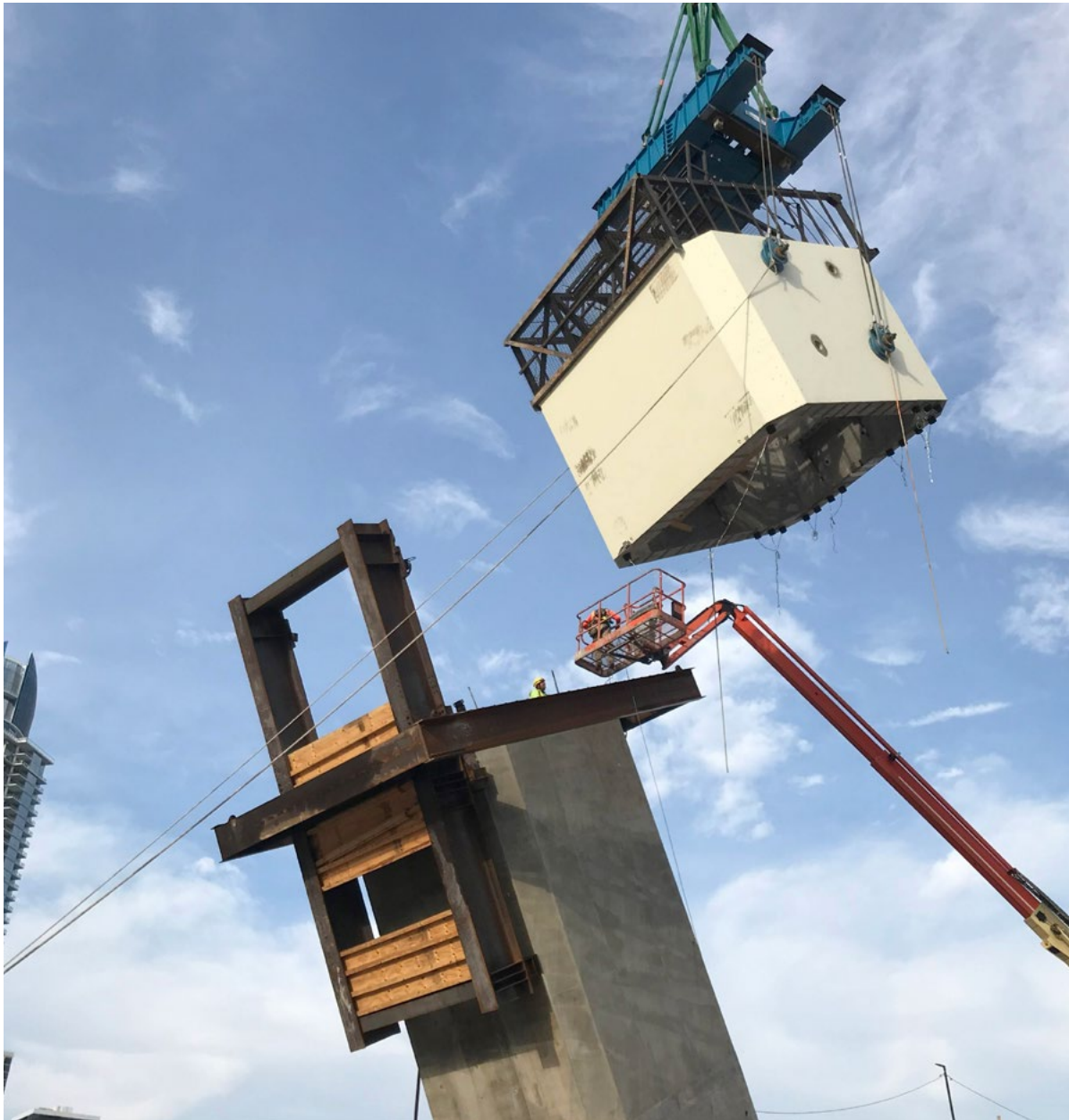
Installation of first pre-cast arch segment for the I-395 signature bridge