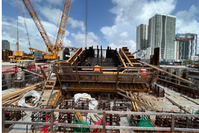
Crews preparing arch footer for concrete pour of the first cast in place starter arch