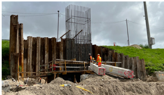
Work on SR 836 bridge pier adjacent to NW 7 Avenue