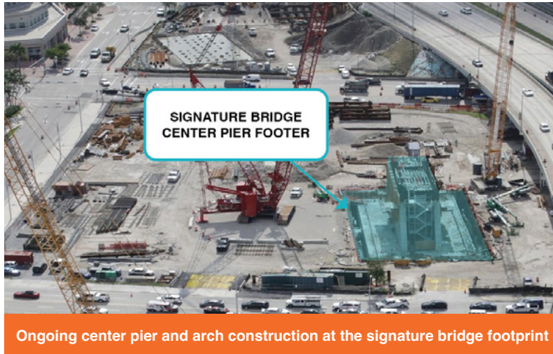
Ongoing center pier and arch construction at the signature bridge footprint