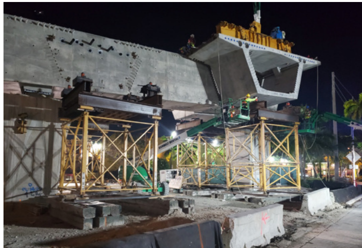
Installation of I-395 bridge segments at NW 3 Avenue