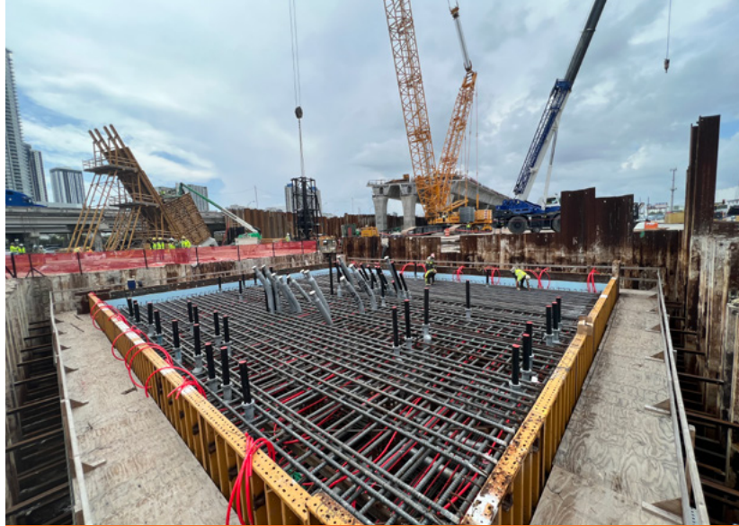
Ongoing rebar installation at one of the four arches currently under construction.