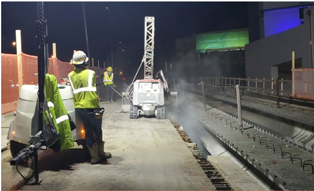
Hydrodemolition equipment being used to remove sections of existing concrete decking to widen eastbound SR 836 from NW 12 Avenue to I-95